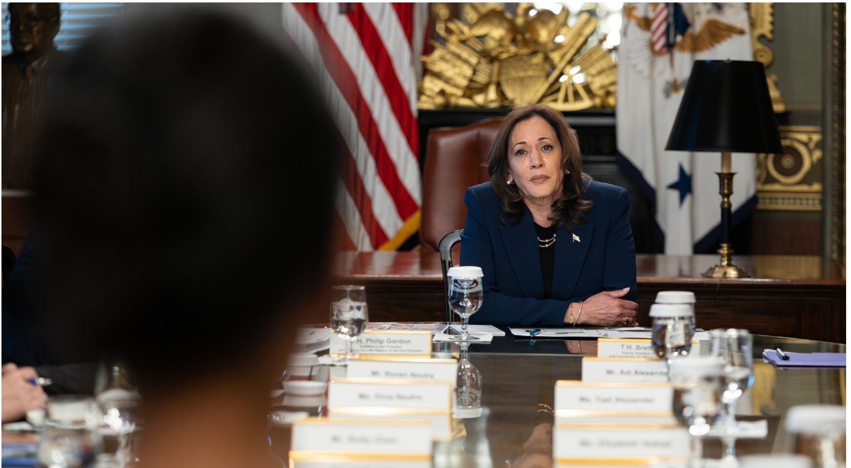
WHITE HOUSE MEETING WITH FAMILIES OF HOSTAGES KIDNAPPED IN THE OCTOBER 7, 2023, HAMAS TERRORIST ATTACK ON ISRAEL. APRIL 9, 2024.

“ Hamas is an evil terrorist organization. I strongly condemn Hamas’ continued brutality, and so must the entire world. From its massacre of 1,200 people to sexual violence, taking of hostages, Hamas’ depravity is evident and horrifying. The threat Hamas poses to the people of Israel—and American citizens in Israel—must be eliminated and Hamas cannot control Gaza. The Palestinian people too have suffered under Hamas’ rule for nearly two decades. As vice president, I have no higher priority than the safety of American citizens, wherever they are in the world. President Biden and I will never waver in our commitment to free the Americans and all those held hostage in Gaza. ”