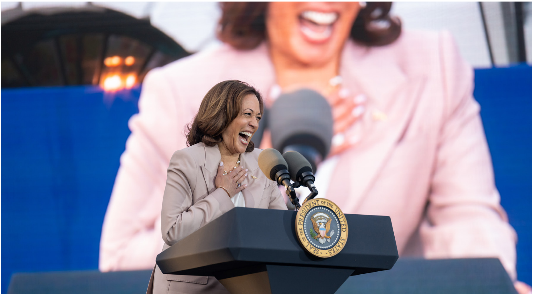
WELCOMING CONCERTGOERS TO A JUNETEENTH EVENT ON THE SOUTH LAWN OF THE WHITE HOUSE. JUNE 13, 2023.

“America is a promise — a promise of freedom, liberty and justice. The story of Juneteenth is the story of our ongoing fight to realize that promise, not for some, but for all. On Juneteenth, we are also reminded of the duality of progress. As we fight to move forward to expand freedom, we must also fight to protect the freedoms already won. We can take nothing for granted in that regard. We fight to make sure that all Americans have the freedom to learn our country’s history in full. Because while we celebrate a holiday dedicated to teaching and honoring America’s full history, extremists across our country attempt to ban books and erase our past. Let us be very clear: Black history is American history.”