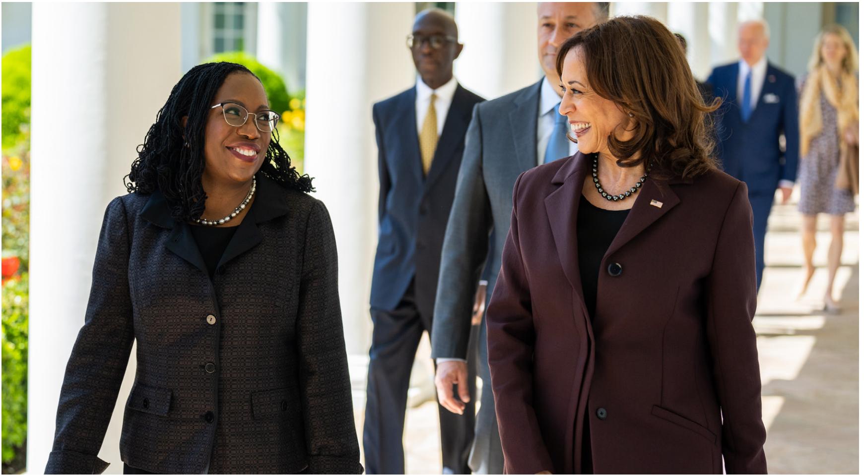
WALKING ALONG THE WEST COLONNADE WITH KETANJI BROWN JACKSON AFTER HER CONFIRMATION AS A SUPREME COURT JUSTICE. APRIL 8, 2022.

“When I presided over the Senate confirmation vote yesterday, I drafted a note to my goddaughter. And I told her that I felt such a deep sense of pride and joy and about what this moment means for our nation and for her future. I told her what I knew this would mean for her life and all that she has in terms of potential. The road toward our more perfect union is not always straight and it is not always smooth. But sometimes it leads to a day like today, a day that reminds us what is possible.”