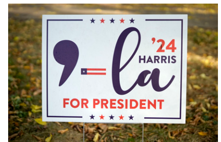
TIME OF THE SIGNS. OCTOBER 13, 2024.

“I always start my campaigns early, and I run hard. Maybe it comes from the rough-and-tumble world of San Francisco politics, where it’s not even a contact sport—it’s a blood sport. This is how I am as a candidate. This is how I run campaigns.”