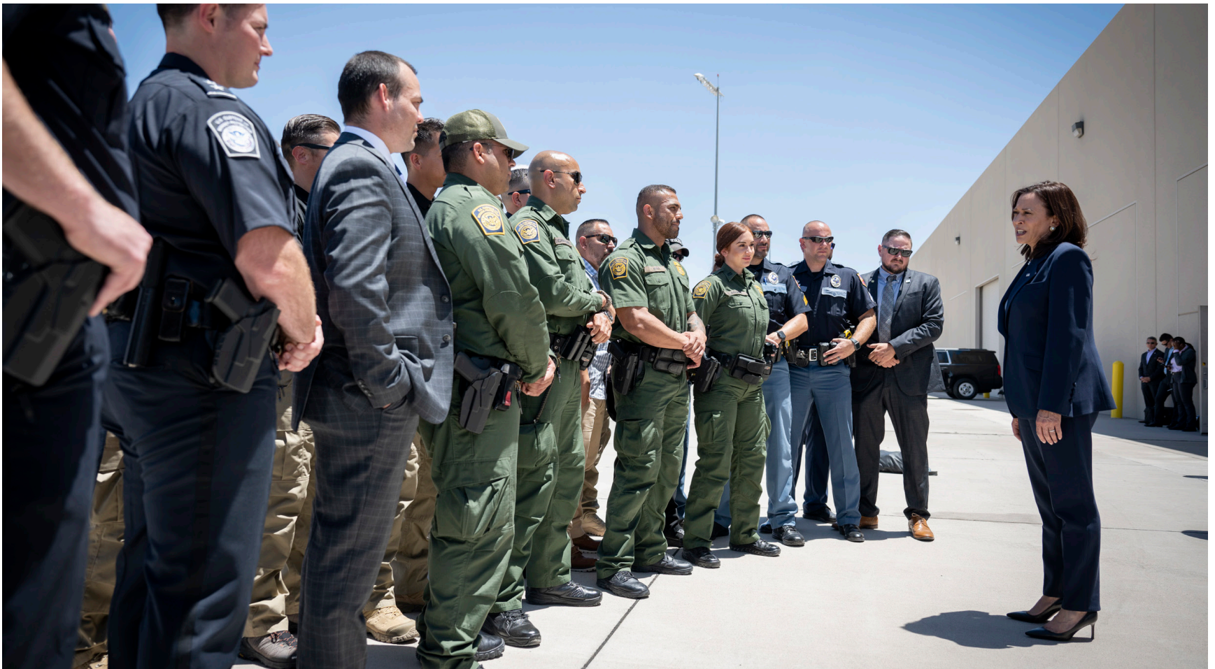
MEETS WITH BORDER GUARDS AND OFFICIALS NEAR THE UNITED STATES—MEXICO BORDER IN EL PASO, TEXAS. JUNE 5, 2021.

“The work that we have to do is the work of addressing the cause—the root causes. Otherwise, we will continue to see the effect—what is happening at the border. It is going to require a comprehensive approach that acknowledges the recognition that the United States is a neighbor in the Western Hemisphere. Not only do we have a reason to concern ourselves with the root cause issues because of what we see at the border, but also because we live in that neighborhood, the Western Hemisphere. And like anyone living in a neighborhood, one must understand and see the effect and the relationship between fellow neighbors. Let’s not lose sight of the fact that we’re talking about human beings.”