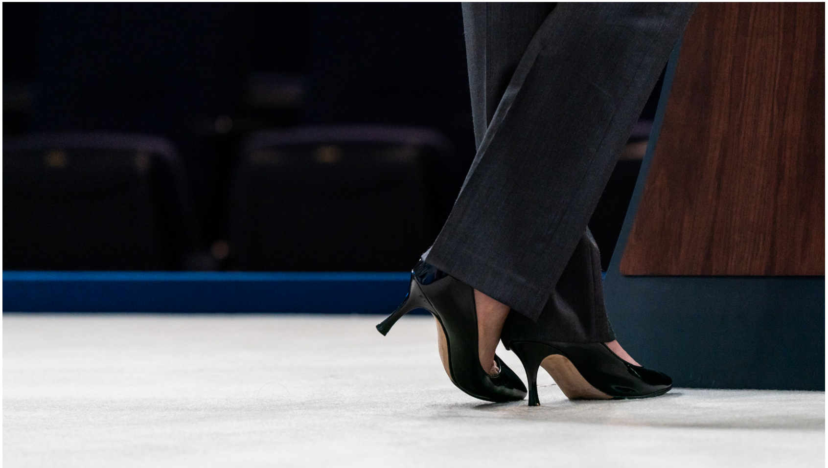
AT THE PODIUM IN THE WHITE HOUSE DELIVERING REMARKS VIRTUALLY TO THE NATIONAL BAR ASSOCIATION. JULY 27, 2021.