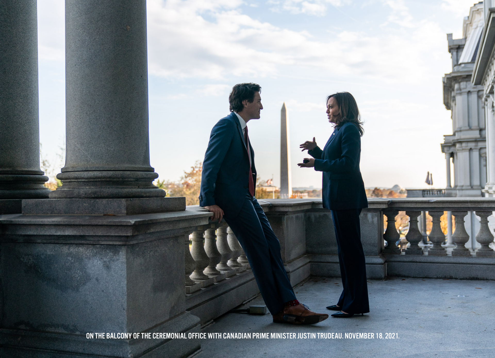
ON THE BALCONY OF THE CEREMONIAL OFFICE WITH CANADIAN PRIME MINISTER JUSTIN TRUDEAU. NOVEMBER 18, 2021.