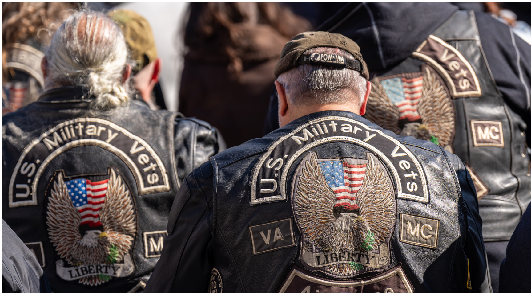
AT THE NATIONAL VETERANS DAY OBSERVANCE CEREMONY AT ARLINGTON NATIONAL CEMETERY IN VIRGINIA. NOVEMBER 11, 2023.

“From the fields of Yorktown to the trenches of the Marne, from the beaches of Normandy to the banks of the Chosin Reservoir and the streets of Saigon, from Baghdad to Fallujah to Kandahar, you stood as one to protect our democracy and our freedom. Here on hallowed ground, we also remember those who gave their lives for our nation. We remember our service members who have not yet returned and their families. And we reaffirm our commitment to bring home all those missing in action. To be a veteran is to have truly known the true cost of freedom and to have borne it for all of us.”