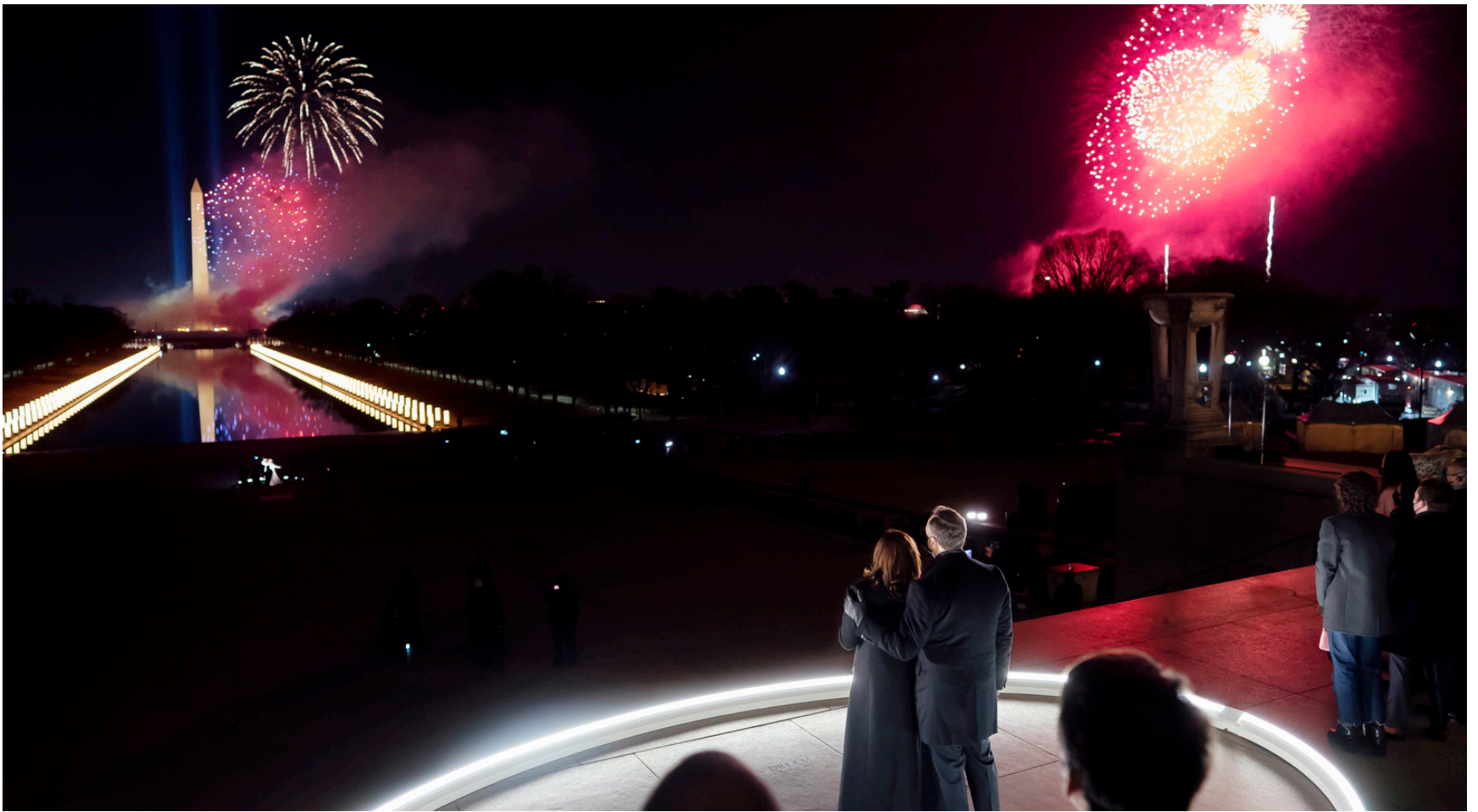
FIREWORKS ABOVE THE NATIONAL MALL TO CELEBRATE THE INAUGURATION. JANUARY 20, 2021.

“It is my honor to be here. To stand on the shoulders of those who came before. To speak tonight as your vice president. In many ways, this moment embodies our character as a nation. It demonstrates who we are. Even in dark times. We not only dream. We do. We not only see what has been, we see what can be. We are bold, fearless and ambitious. We are undaunted in our belief that we shall overcome, that we will rise up.”