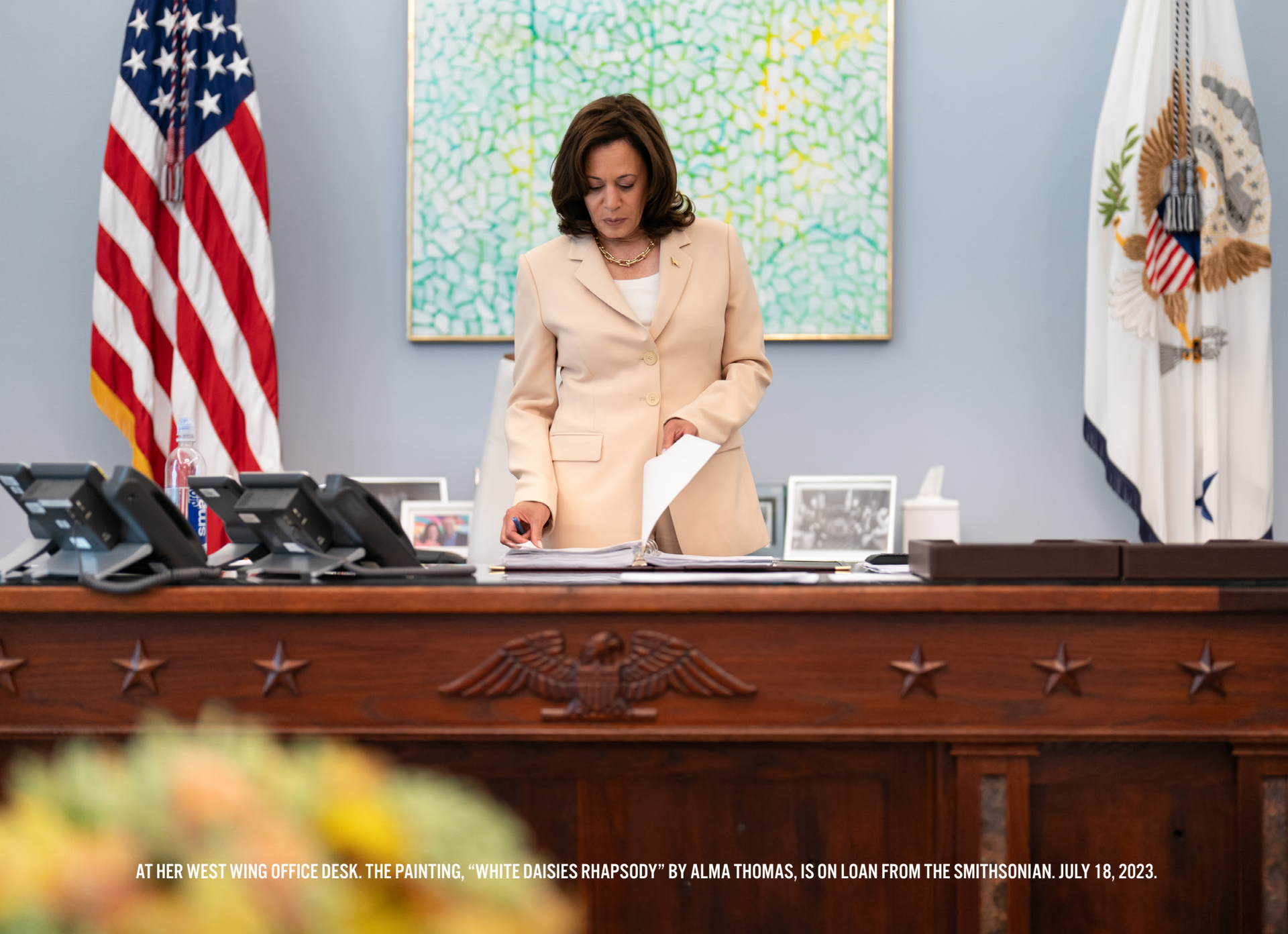
AT HER WEST WING OFFICE DESK. THE PAINTING, "WHITE DAISIES RHAPSODY" BY ALMA THOMAS, IS ON LOAN FROM THE SMITHSONIAN. JULY 18, 2023.