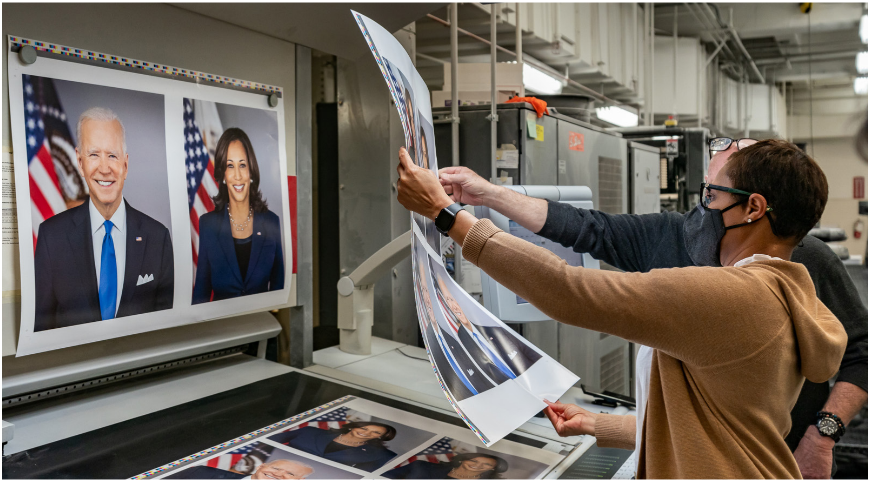
NEW OFFICIAL PORTRAITS ARE PROOFED AT THE GOVERNMENT PRINTING OFFICE IN WASHINGTON, D.C. MAY 13, 2021.

“There are those who will continue to say that what we’re doing now is too big and too bold. I would remind them that our nation is at its best when we do big things. Think about it: the New Deal, the Great Society. In America, when we shoot for the moon, we plant our flag on it. So, let’s seize this moment, knowing the people will feel it when we do. If we seize this moment, history is going to remember.”