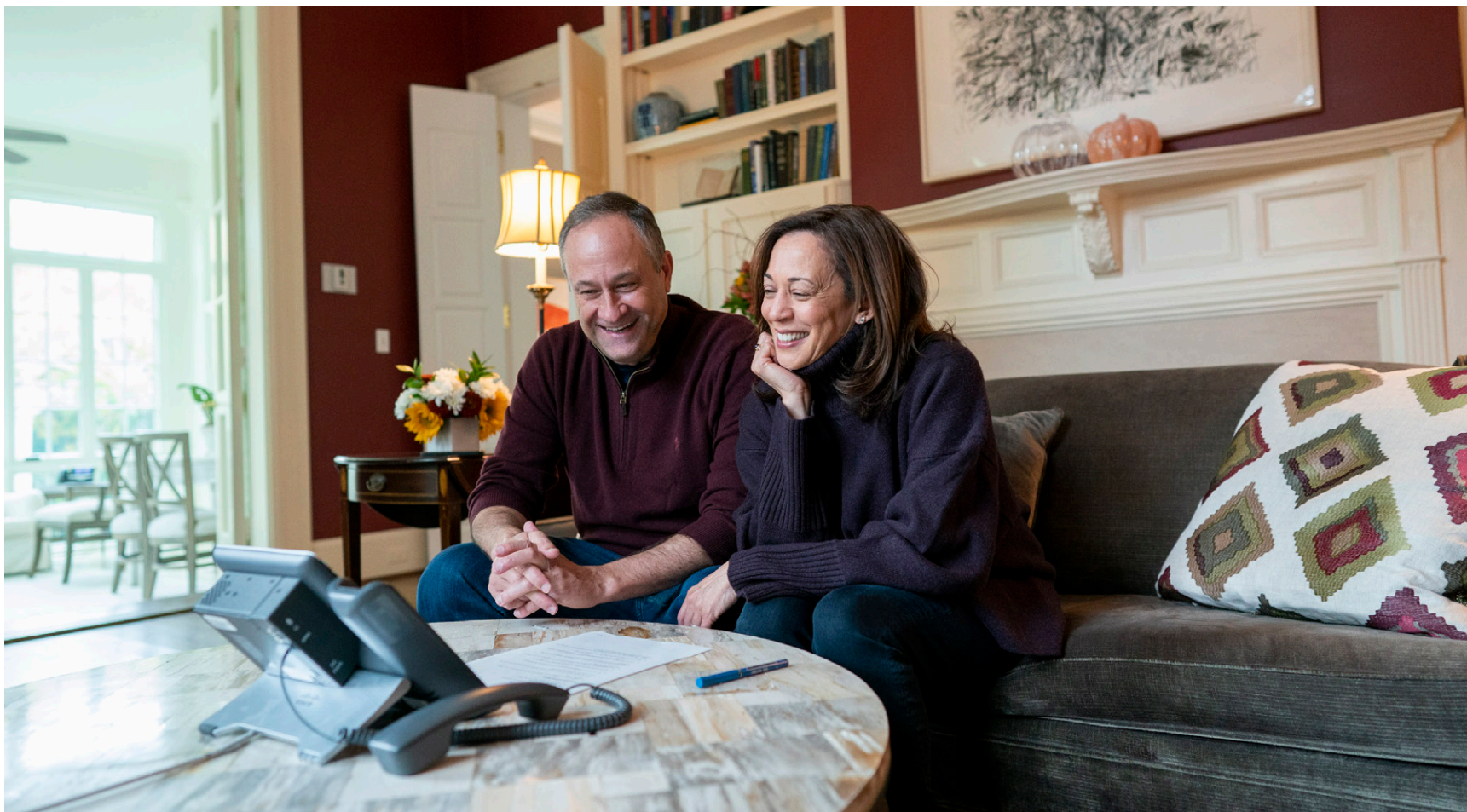
MAKING CALLS ON THANKSGIVING DAY FROM THE VICE PRESIDENT'S RESIDENCE. NOVEMBER 25, 2021.

On Doug Emhoff: “The first date was a blind date, and the rest is history. I have the first voicemail he ever left me. I actually do. It just rambles on and on and on, and it was just the cutest thing. I mean he just kept going and going and said, ‘I guess I’ll talk to you at some point.’ We laugh about it, but it was just the sweetest thing ever.”