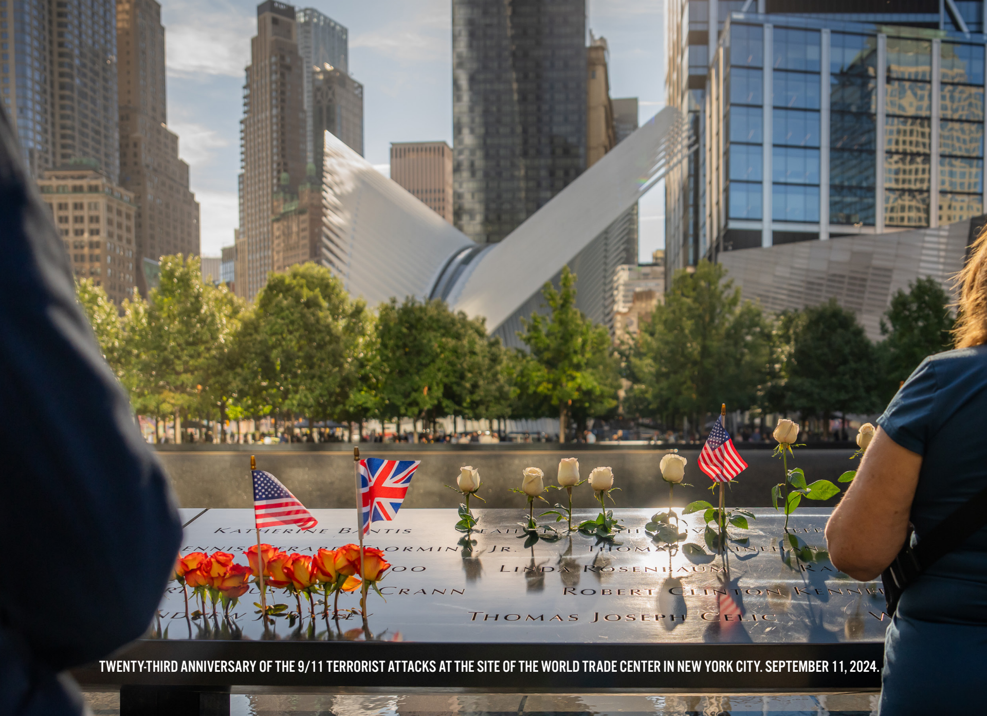
TWENTY-THIRD ANNIVERSARY OF THE 9/11 TERRORIST ATTACKS AT THE SITE OF THE WORLD TRADE CENTER IN NEW YORK CITY. SEPTEMBER 11, 2024.