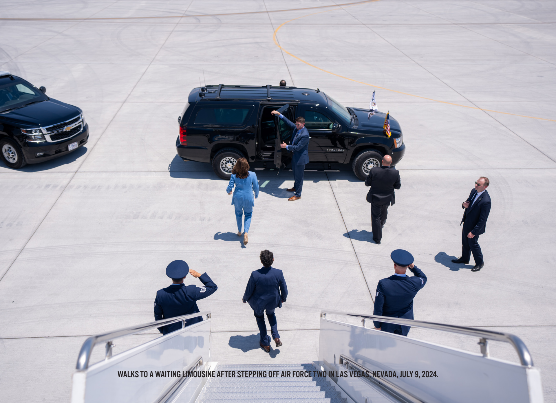
WALKS TO A WAITING LIMOUSINE AFTER STEPPING OFF AIR FORCE TWO IN LAS VEGAS, NEVADA, JULY 9, 2024.