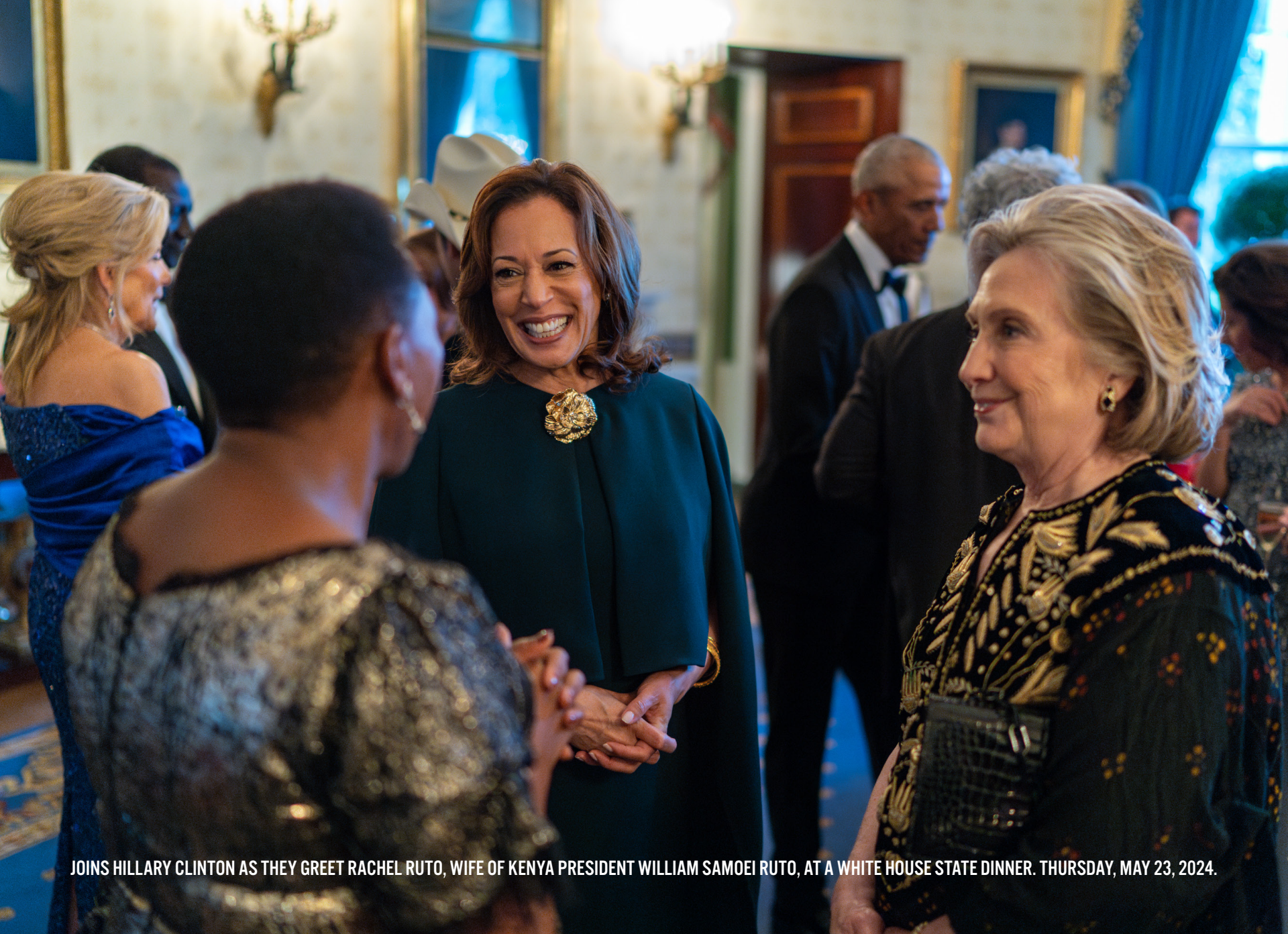
JOINS HILLARY CLINTON AS THEY GREET RACHEL RUTO, WIFE OF KENYA PRESIDENT WILLIAM SAMOEI RUTO, AT A WHITE HOUSE STATE DINNER. THURSDAY, MAY 23, 2024.