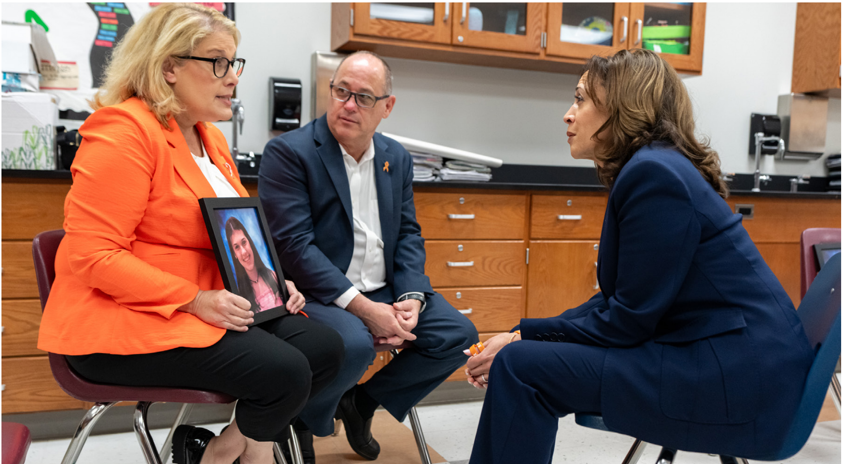
VISITS PARENTS OF STUDENTS KILLED IN THE 2018 MASSACRE AT MARJORY STONEMAN DOUGLAS HIGH SCHOOL IN PARKLAND, FLORIDA. MARCH 23, 2024.

“I do believe we have a duty to remember and a duty to bear witness to what happened here. This school is soon going to be torn down, but the memory of it will never be erased. And let us, through the courage and the call to action of these families, find it in ourselves to consider what they’ve been through as some level of motivation and inspiration for all of us to do more.”