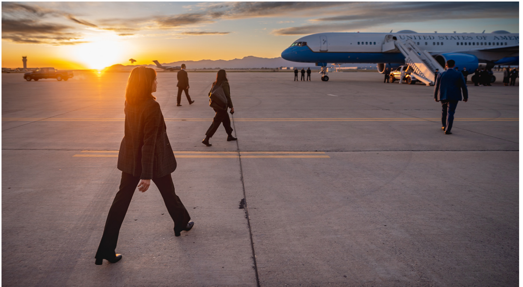
WALKING THE TARMAC AS THE SUN SETS AT LUKE AIR FORCE BASE IN MARICOPA COUNTY, ARIZONA. JANUARY 19, 2023.

“We love our country, and we believe in the promise of America. And we know the privilege and pride that comes with being an American. I do believe it is one of the highest forms of patriotism to fight for the ideals of our country. That is how we realize the promise of America.”