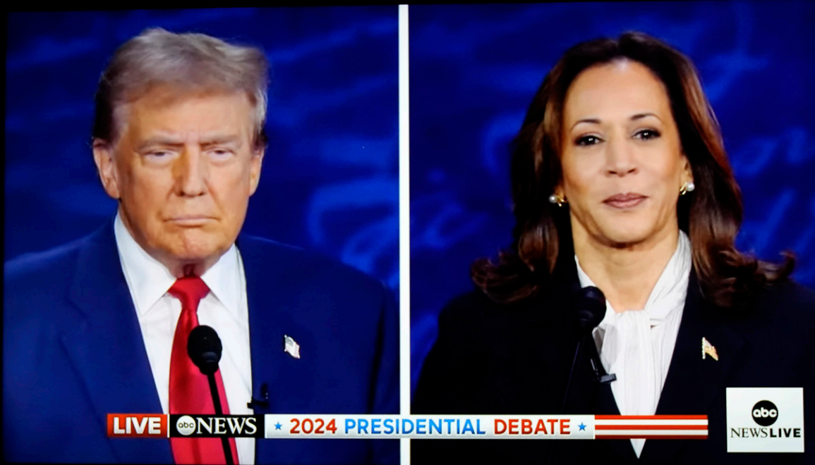
DEBATES FORMER PRESIDENT DONALD TRUMP IN PHILADELPHIA. SEPTEMBER 10, 2024.

“In many ways, Donald Trump is an unserious man. But the consequences of putting Donald Trump back in the White House are extremely serious.”