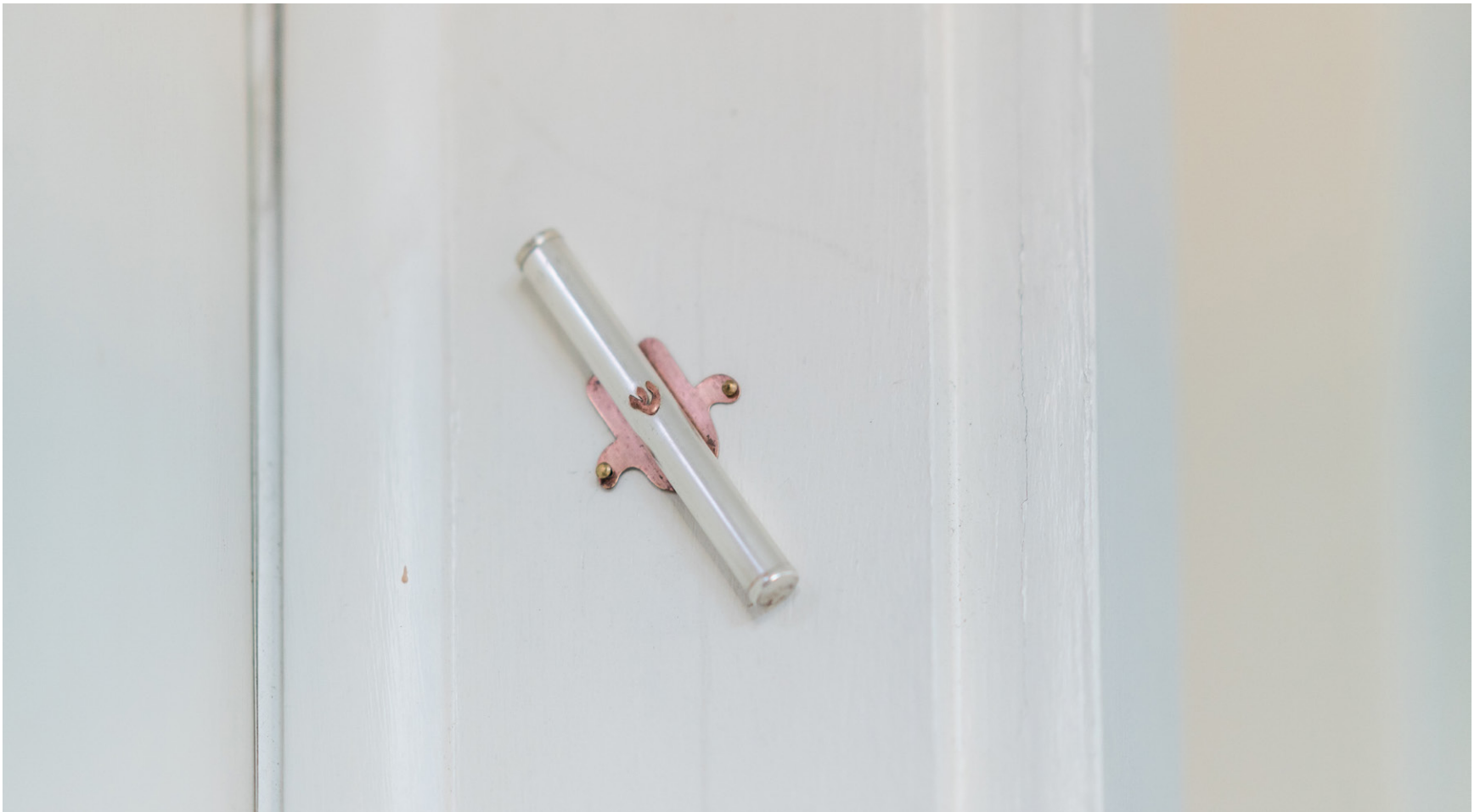
A MEZUZAH, SIGN OF A JEWISH HOUSEHOLD, IN THE DOORWAY OF THE VICE PRESIDENT'S RESIDENCE. DOUG EMHOFF IS JEWISH. OCTOBER 7, 2021.

“Racism is real in America, and it has always been. Xenophobia is real in America, and always has been. Sexism, too. People who are perceived as Muslim know what it was like to live in our country after 9/11. Ultimately, this is about who we are as a nation. This is about how we treat people with dignity and respect. Everyone has the right to go to work, to go to school, to walk down the street and be safe. And also, the right to be recognized as an American – not as the other, not as them, but as us. A harm against any one of us is a harm against all of us.”