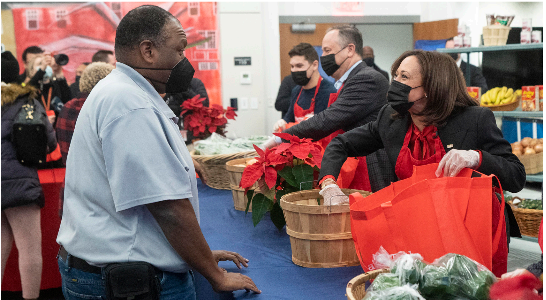
VOLUNTEERING TO DISTRIBUTE FOOD AT MARTHA'S TABLE, A WASHINGTON, D.C., COMMUNITY CHARITY. DECEMBER 22, 2022.

“And from a very young age, I learned that when people stand together, when we join voices, knowing that the vast majority of us have so much more in common than what separates us – when we join those voices, we can drive extraordinary change. Which is why I believe in my heart and soul no one should ever be made to fight alone. We are all in this together.”