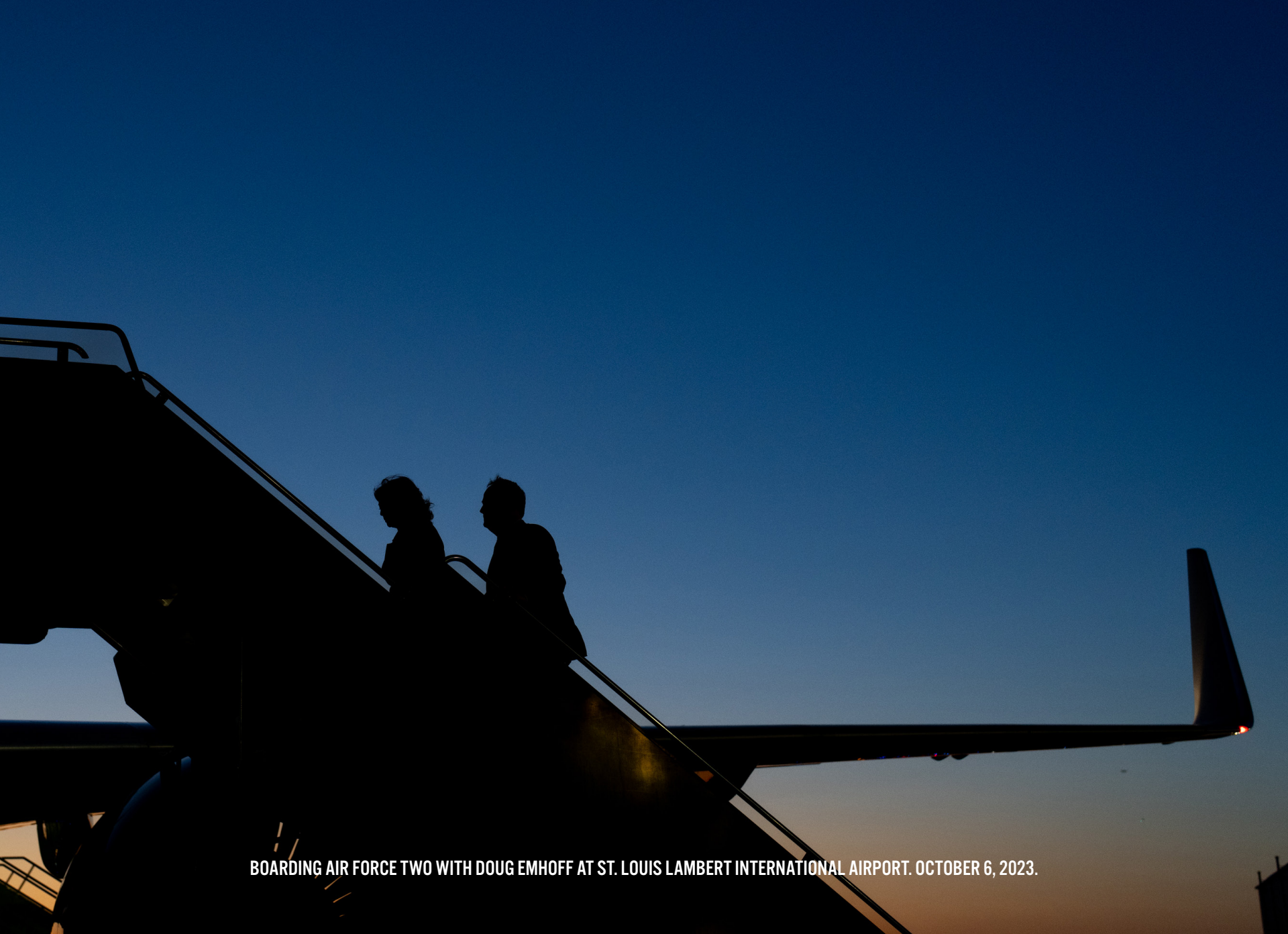
BOARDING AIR FORCE TWO WITH DOUG EMHOFF AT ST. LOUIS LAMBERT INTERNATIONAL AIRPORT. OCTOBER 6, 2023.