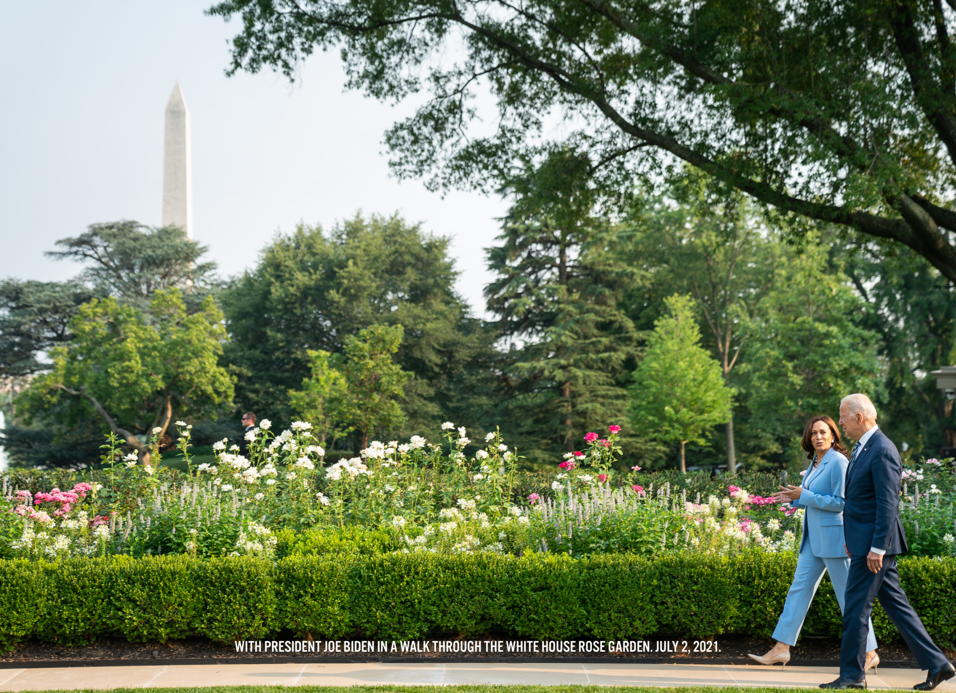
WITH PRESIDENT JOE BIDEN IN A WALK THROUGH THE WHITE HOUSE ROSE GARDEN. JULY 2, 2021.