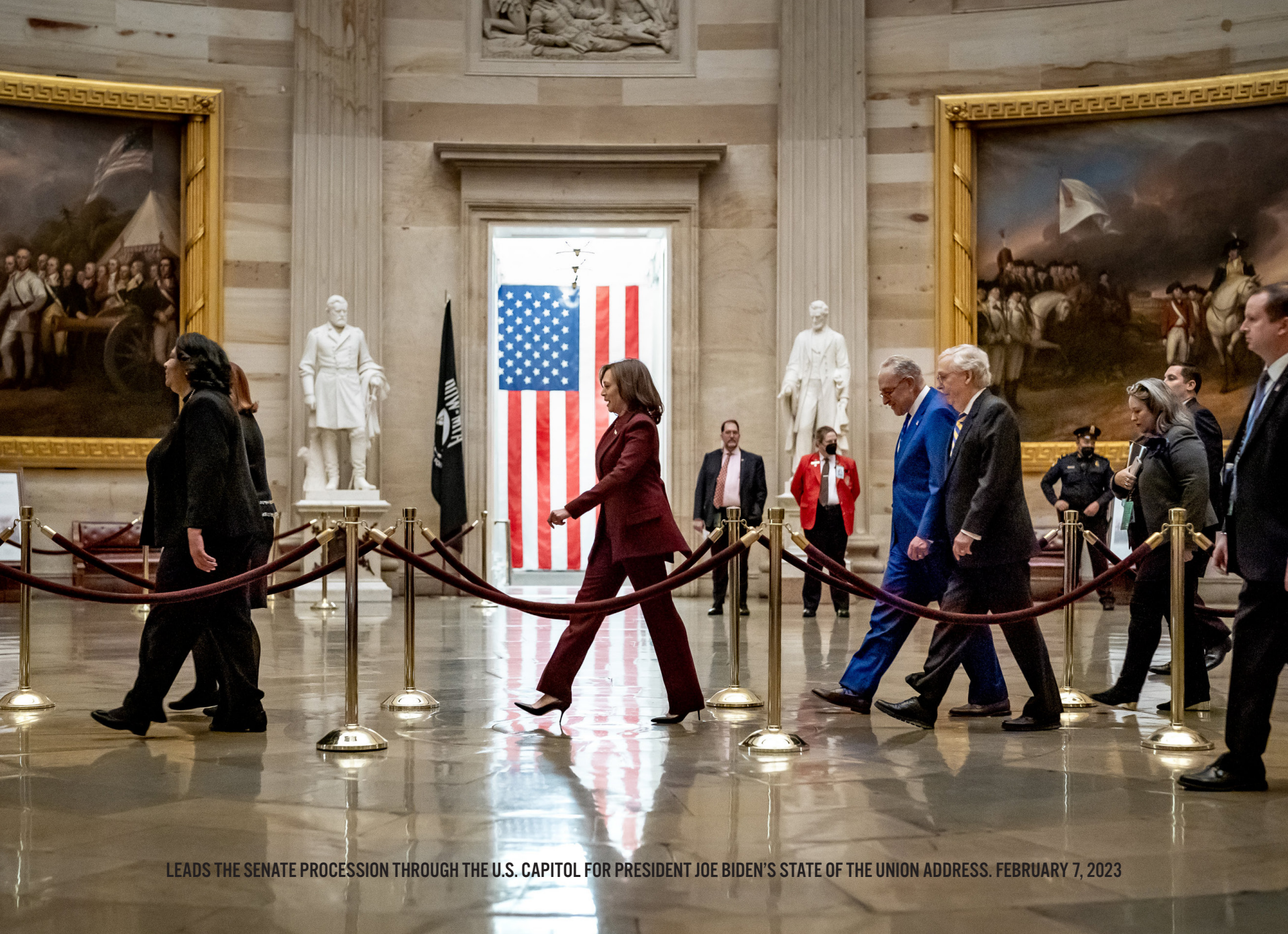
LEADS THE SENATE PROCESSION THROUGH THE U.S. CAPITOL FOR PRESIDENT JOE BIDEN'S STATE OF THE UNION ADDRESS. FEBRUARY 7, 2023