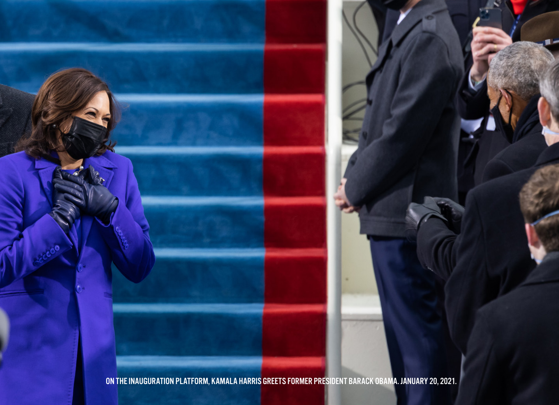
ON THE INAUGURATION PLATFORM, KAMALA HARRIS GREETS FORMER PRESIDENT BARACK OBAMA. JANUARY 20, 2021.