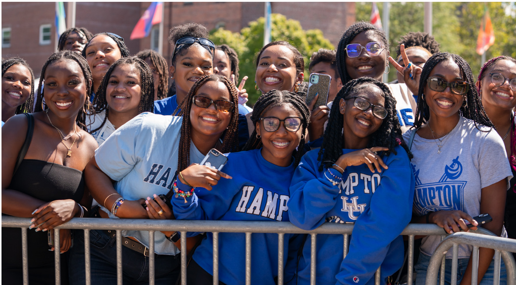
STUDENTS GATHER FOR A KAMALA HARRIS SPEECH AT HAMPTON UNIVERSITY IN VIRGINIA. SEPTEMBER 14, 2023.

“For many of you, when you leave here, you are going to often find yourself in rooms where you may be the only one like you, the only one that looks like you, the only one that has had your life experience. During this experience you are having here at Hampton, take moments to be very conscious about who you are surrounded by and hold on to that. Because when you walk in those rooms, I want you to remember you are not alone. I want you to remember that we’re all in those rooms with you, cheering you on.”