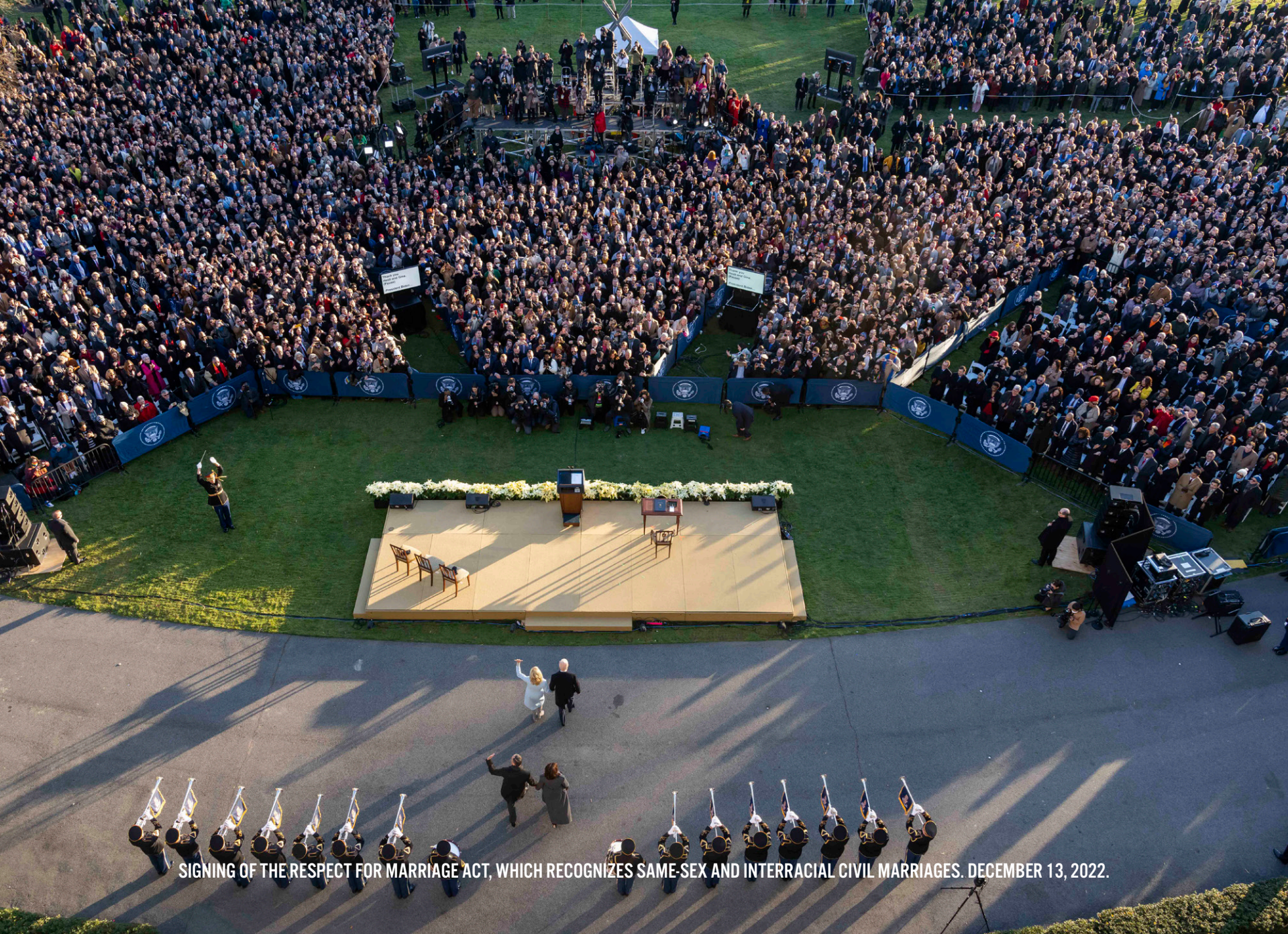
SIGNING OF THE RESPECT FOR MARRIAGE ACT, WHICH RECOGNIZES SAME-SEX AND INTERRACIAL CIVIL MARRIAGES. DECEMBER 13, 2022.