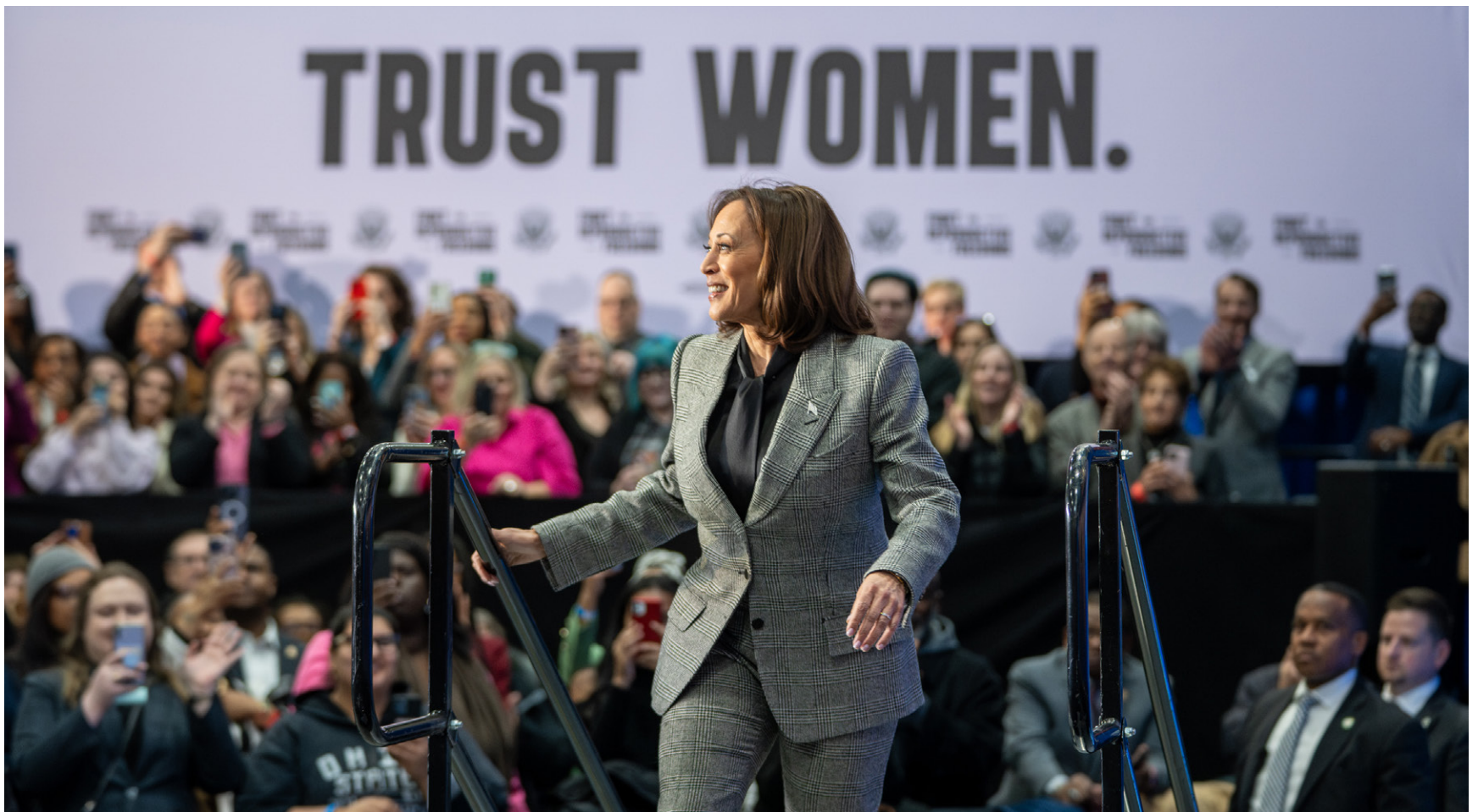
KICKOFF OF THE REPRODUCTIVE FREEDOMS TOUR IN BIG BEND, WISCONSIN, ON THE FIFTY-FIRST ANNIVERSARY OF ROE V. WADE. JANUARY 22, 2024.

“Freedom, I believe, is fundamental to the promise of America — freedom of speech, freedom of worship, freedom of assembly, the freedom to vote. In America, freedom is not to be given. It is not to be bestowed. It is ours by right. And that includes the freedom to make decisions about one’s own body. Fifty-one years ago today, in the case of Roe v. Wade, the United States Supreme Court recognized the fundamental constitutional right to reproductive freedom. However, nineteen months ago, the highest court in our land took a constitutional right from the people of America, from the women of America. We must restore the protections of Roe. What the United States Supreme Court took, Congress can put back in place.”