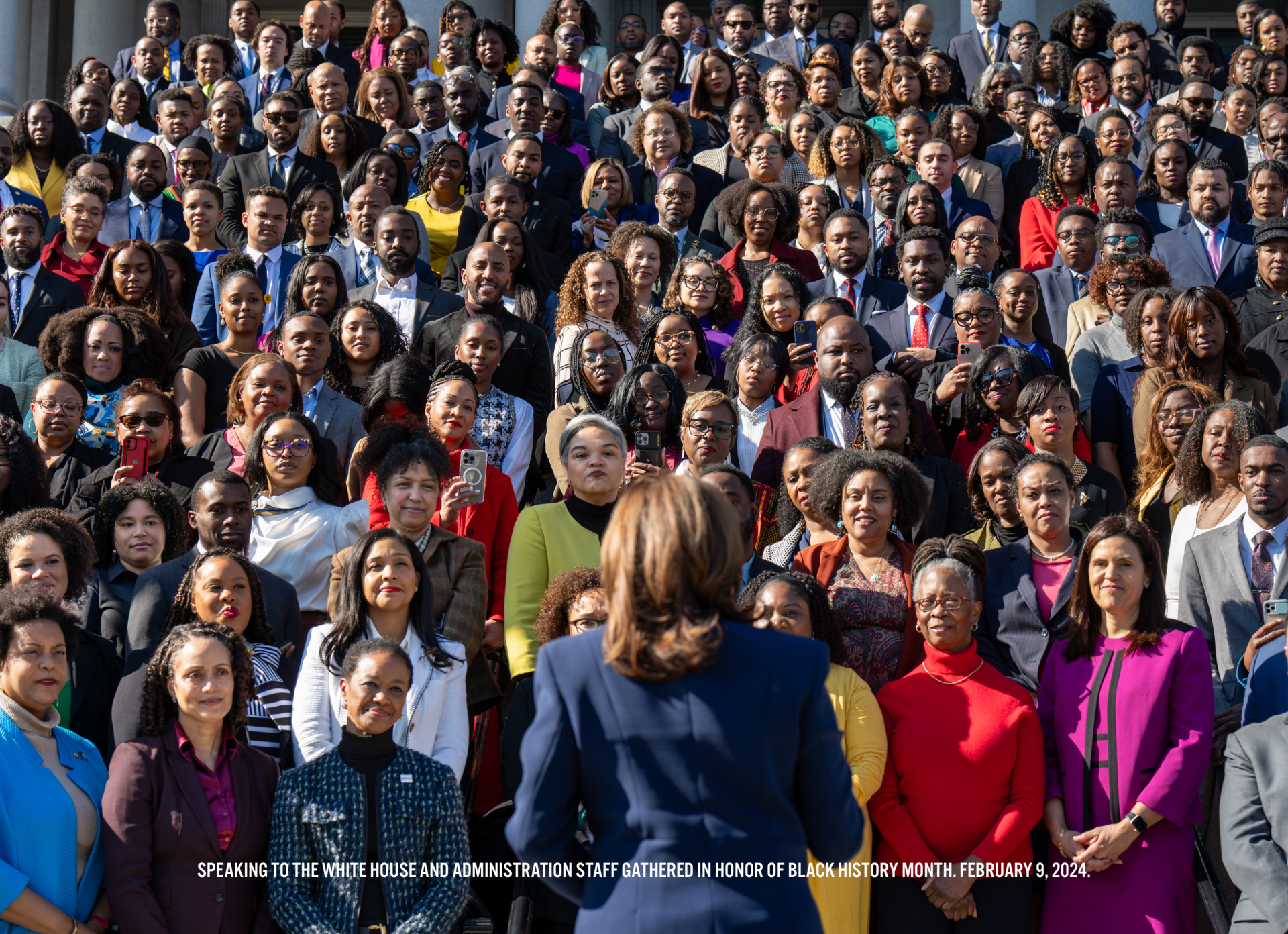
SPEAKING TO THE WHITE HOUSE AND ADMINISTRATION STAFF GATHERED IN HONOR OF BLACK HISTORY MONTH. FEBRUARY 9, 2024.