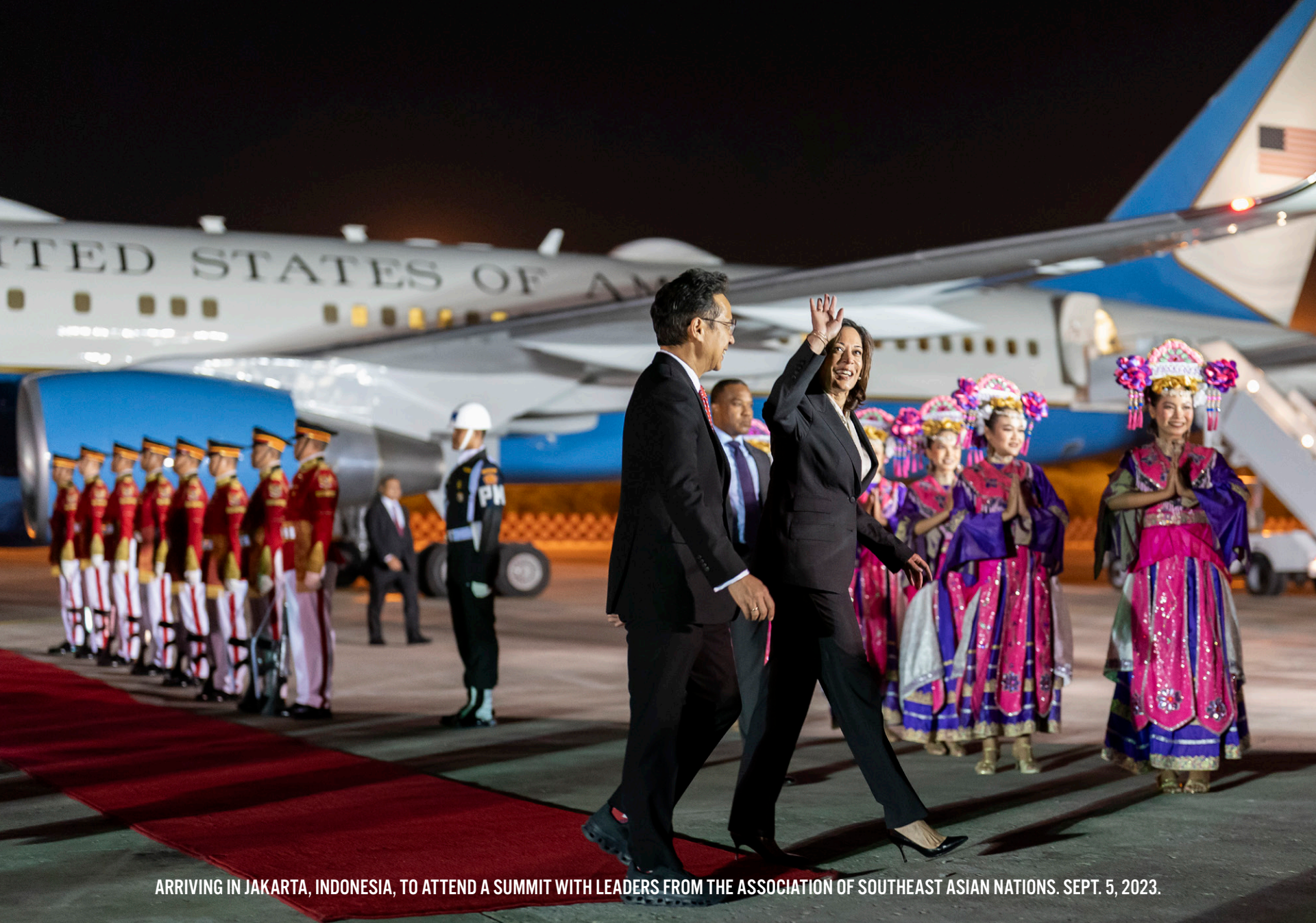
ARRIVING IN JAKARTA, INDONESIA, TO ATTEND A SUMMIT WITH LEADERS FROM THE ASSOCIATION OF SOUTHEAST ASIAN NATIONS. SEPT. 5, 2023.