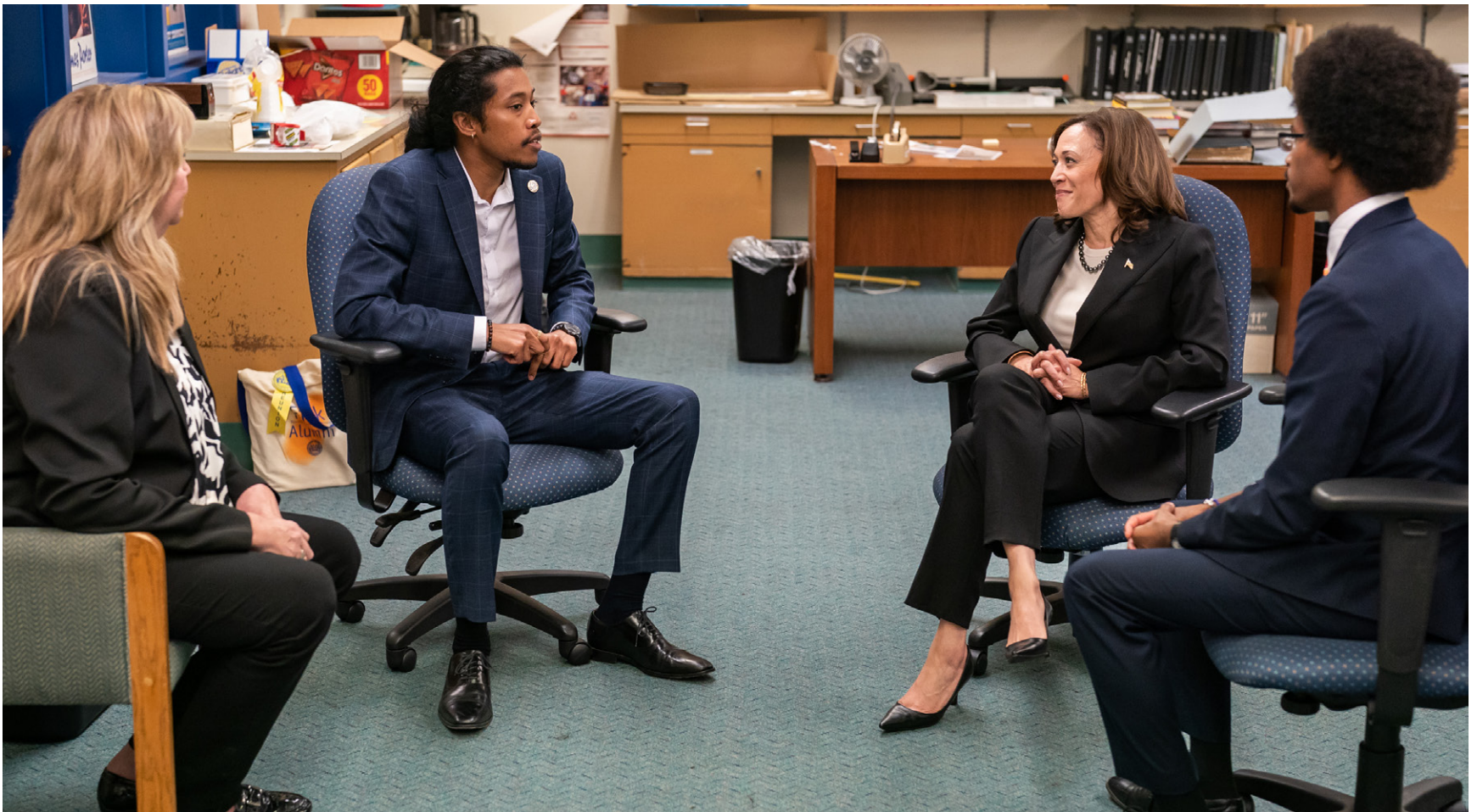
IN NASHVILLE WITH TENNESSEE LEGISLATORS WHO WERE SUBJECT TO AN EXPULSION VOTE FOR LEADING GUN REFORM PROTESTS. APRIL 7, 2003.

“I want to start by recognizing the Tennessee Three. A democracy says you don’t silence the people. You do not stifle the people. You don’t turn off their microphones when they are speaking about the importance of life and liberty. They understood that the voices must be heard. In order to make sure the voices were represented in that place where elected leaders are supposed to lead in a democracy, these leaders had to get a bullhorn to be heard. That happens in a democracy, too. You can’t walk around and talk about protocol. Protocol and procedures were devised to require and allow and encourage debate and discussion and, yes, dissension.”