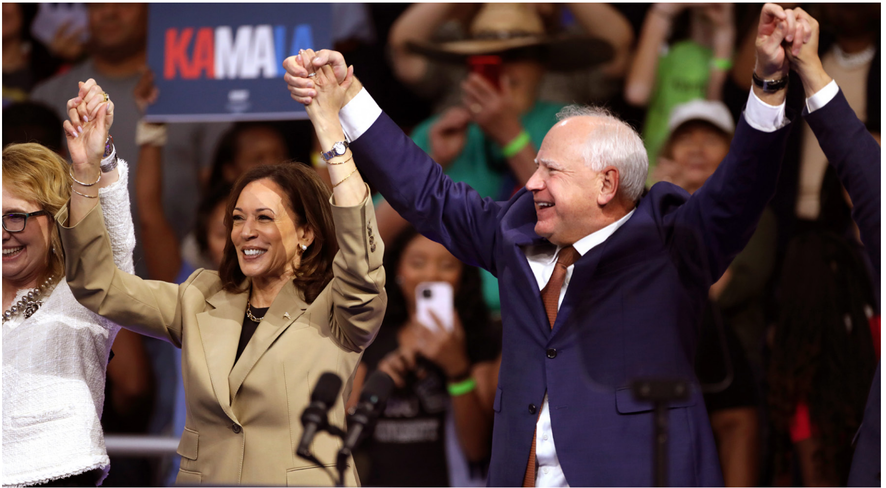
WITH NEWLY ANNOUNCED VICE-PRESIDENTIAL RUNNING MATE TIM WALZ AT RALLY IN GLENDALE, ARIZONA. AUGUST 9, 2024.

“Two middle-class kids: one a daughter of Oakland, California, who was raised by a working mother, the other a son of the Nebraska plains who grew up working on a farm. Coach Walz and I may hail from different corners of our great country, but our values are the same. And we both believe in lifting people up, not knocking them down.”