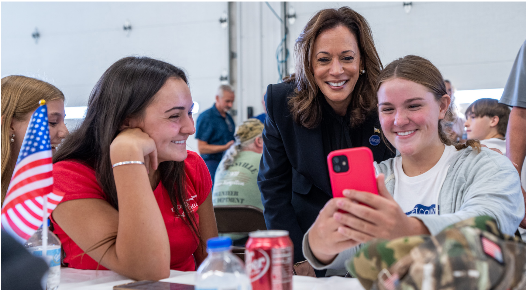
GREETES RESIDENTS IN SHANKSVILLE, PENNSYLVANIA, ON THE ANNIVERSARY OF THE DOWNING OF UNITED AIRLINES FLIGHT 93. SEPTEMBER 11, 2024.

“On September 11, 2001, terrorists sought to attack and destroy our way of life—our democracy, our freedoms and everything we hold dear as Americans. In that endeavor they failed. In the days that followed, we were all reminded that unity is possible in America. Together, we made clear we will not bend or break in the face of terrorism. We rallied around the victims and their families. We worked to overcome the hate and discrimination that many of our fellow Americans experienced following the attacks. And we fought for the country we love and the ideals we cherish. All of this work continues today.”