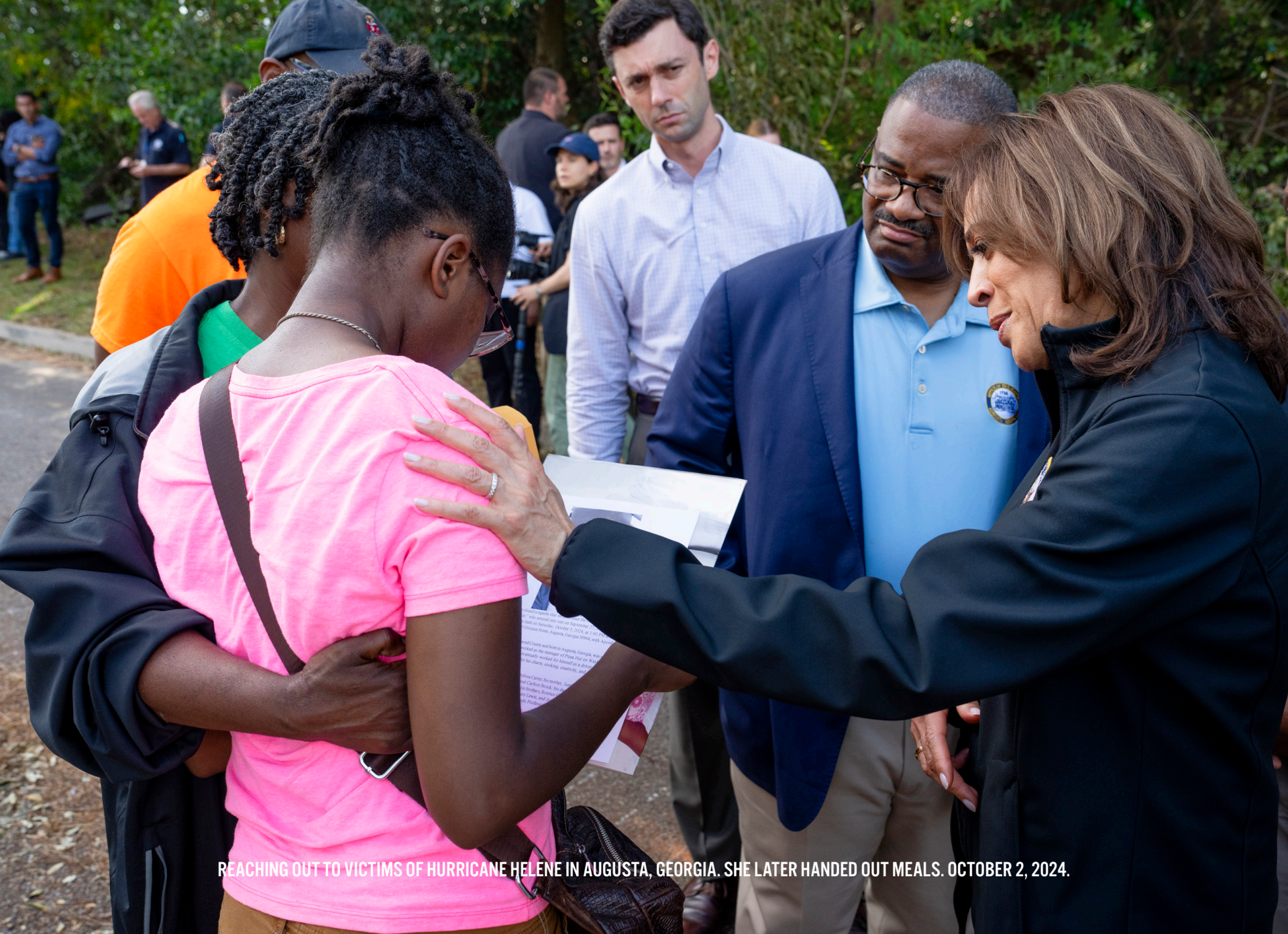
REACHING OUT TO VICTIMS OF HURRICANE HELENE IN AUGUSTA, GEORGIA. SHE LATER HANDED OUT MEALS. OCTOBER 2, 2024.