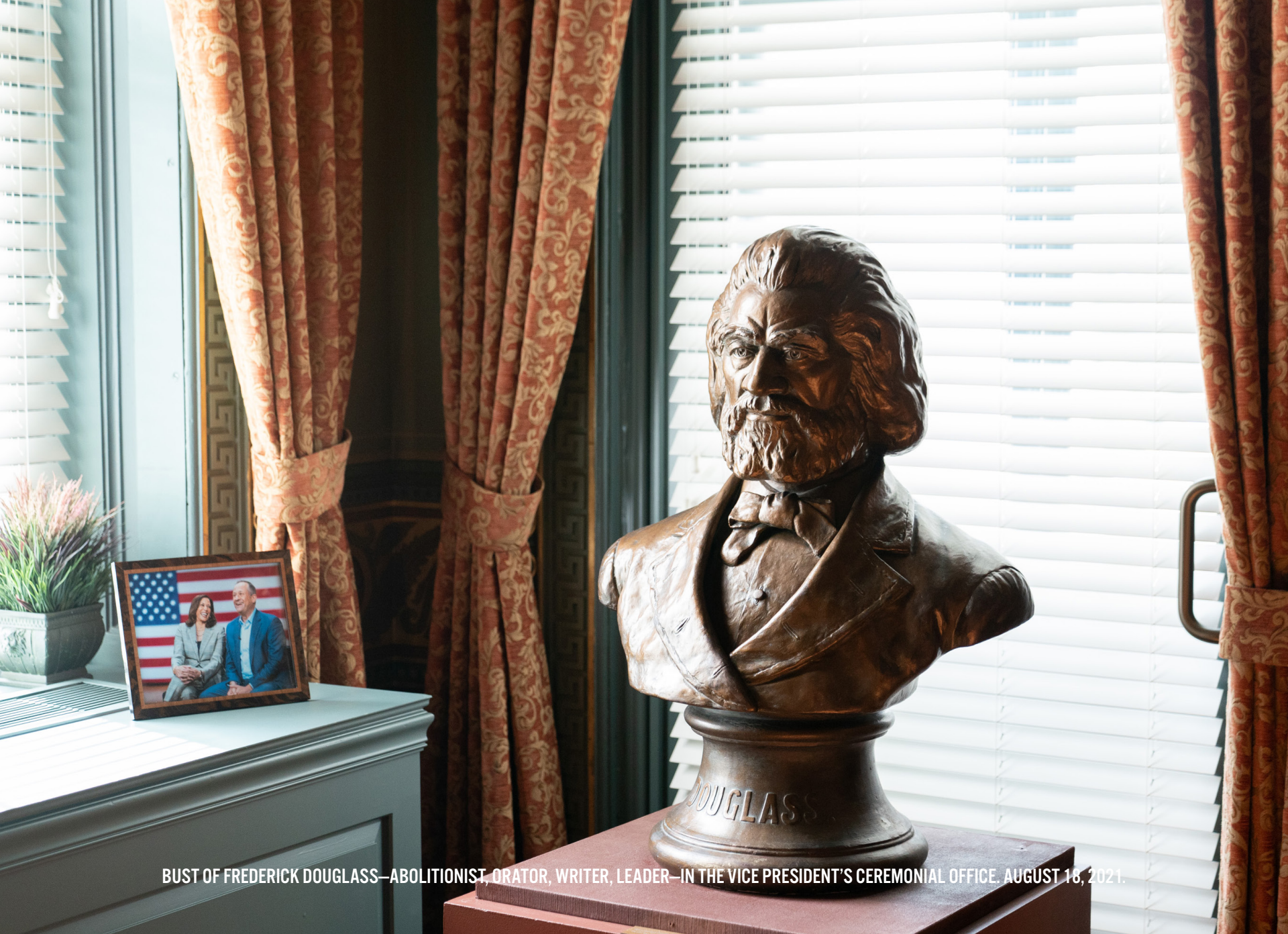
BUST OF FREDERICK DOUGLASS—ABOLITIONIST, ORATOR, WRITER, LEADER—IN THE VICE PRESIDENT'S CEREMONIAL OFFICE. AUGUST 18, 2021.