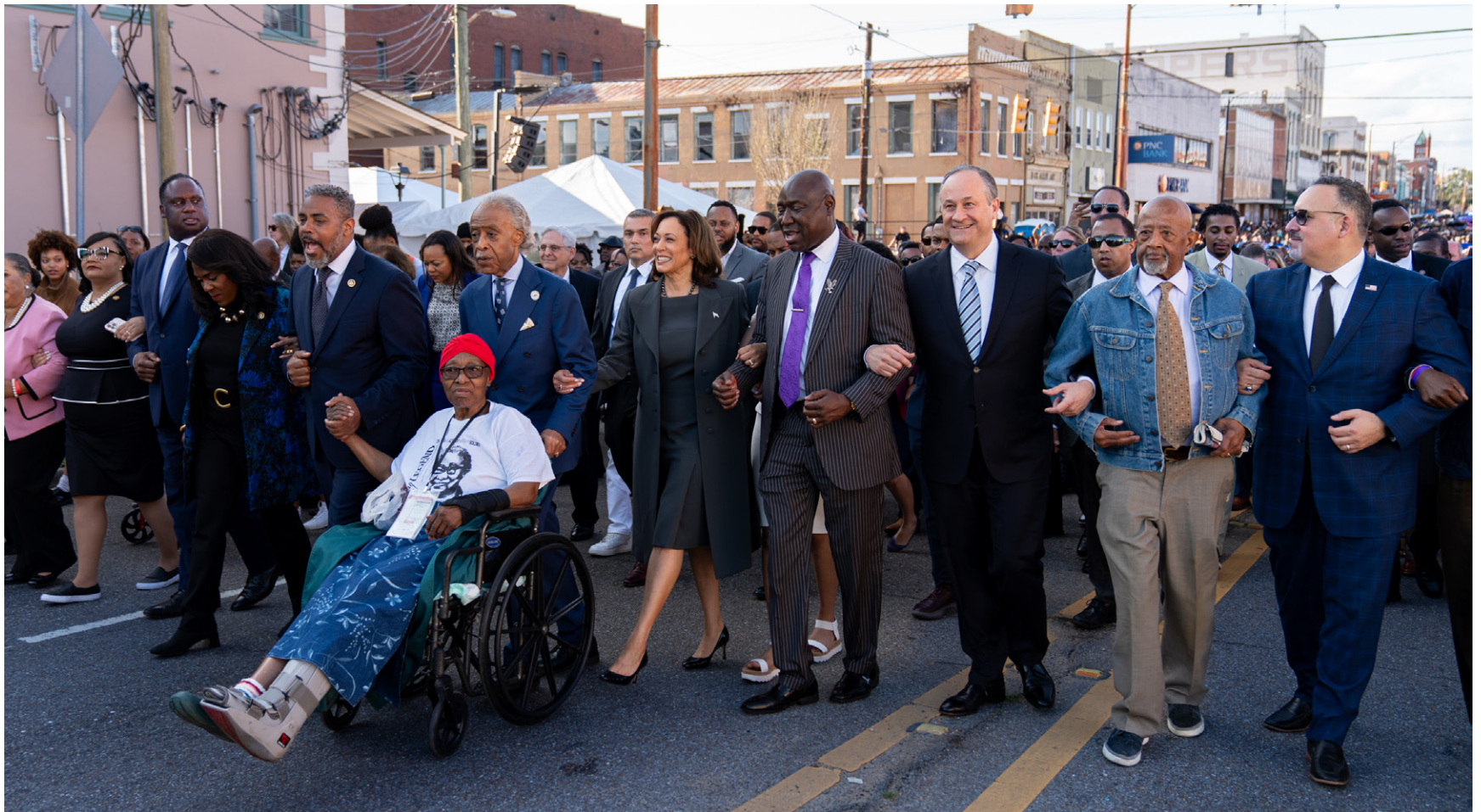
MARCHING THROUGH SELMA, ALABAMA, TO COMMEMORATE THE FIFTY-NINTH ANNIVERSARY OF BLOODY SUNDAY. MARCH 3, 2024.

“In my West Wing office in the White House—yes, that’s where I work—I hung a piece of artwork that is the first thing I see when I walk into my office in the morning. It’s a large, framed photograph taken on Bloody Sunday depicting an injured Amelia Boynton receiving care at the foot of this very bridge. And for me it is a daily reminder of the struggle, of the sacrifice, and of how much we owe to those who gave so much before us. History is a relay race. Generations before us carried the baton. And now, they have passed it to us.”