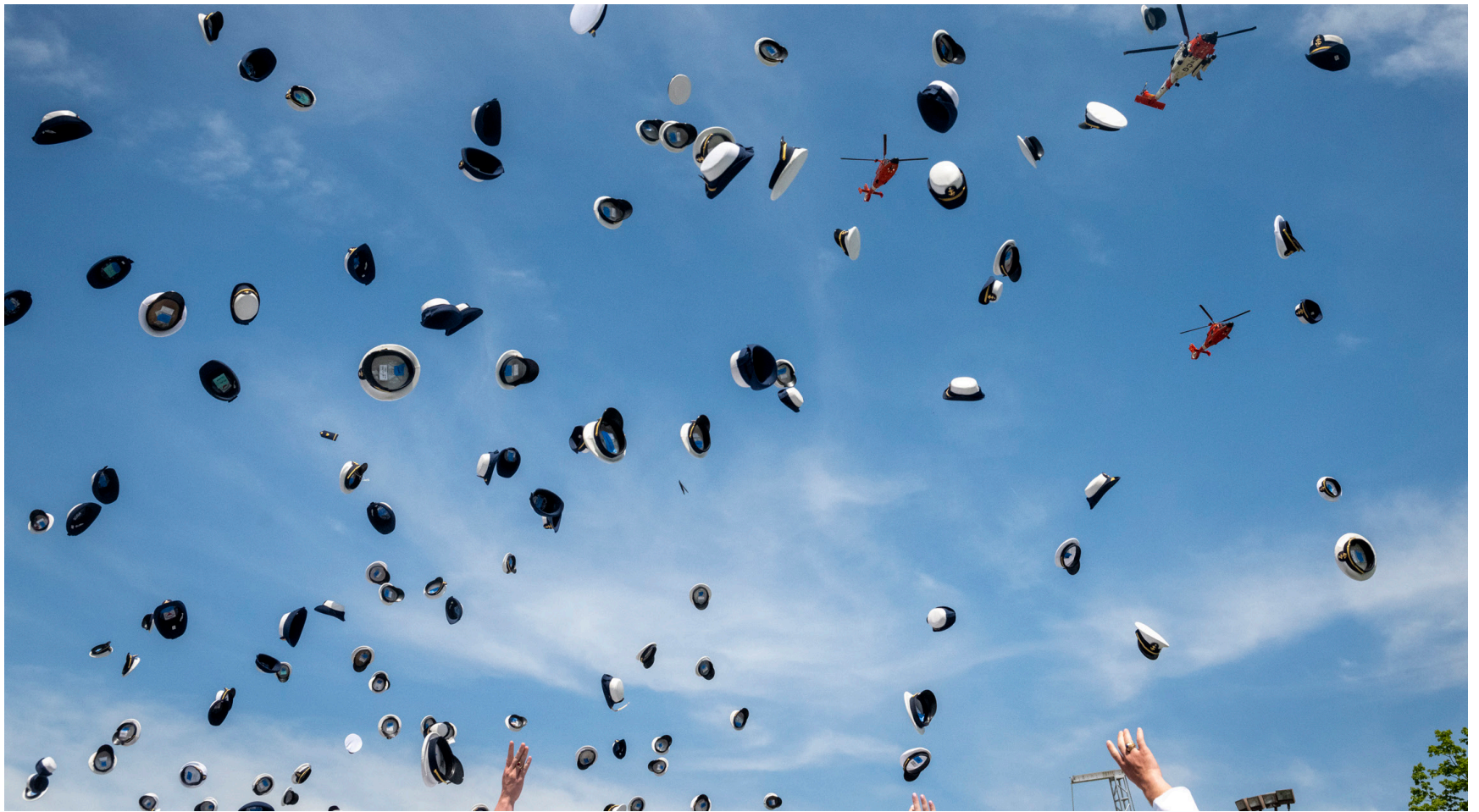
AT THE U.S. COAST GUARD ACADEMY COMMENCEMENT IN NEW LONDON, CONNECTICUT, ON MAY 18, 2022.

“You all graduate into a world that’s going to need your leadership – one that is full of possibility and the promise of progress. At the same time, the world you graduate into is unsettled. It is a world where long-established principles now stand on shaky ground. Where the rule of law in places is strained. Where rules and norms are under question. We must remember, upholding a system of laws, institutions and common understandings is how we ensure the safety and security and prosperity of the United States. And this is how we preserve stability in the world.”