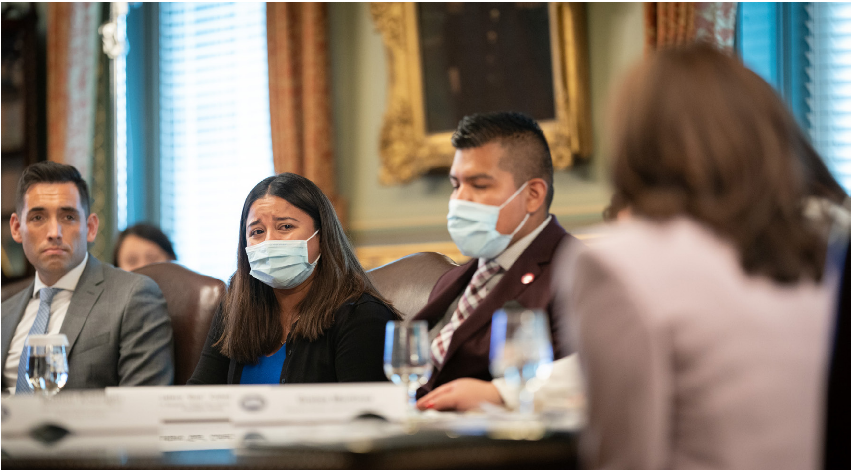
WITH (DACA) DEFERRED ACTION FOR CHILDHOOD ARRIVALS RECIPIENTS AND DREAMERS IN THE EISENHOWER EXECUTIVE OFFICE BUILDING. JULY 22, 2021.

“The status quo of young immigrants living with uncertainty from one case to another is just simply wrong. Let’s be clear about that. To have to live with the level of uncertainty – to wonder whether there’s a knock at the door and what will that mean for you, for your family – it’s just wrong. This [American Dream and Promise Act] is about what is morally right. This is a reflection of who we say we are as a country.”