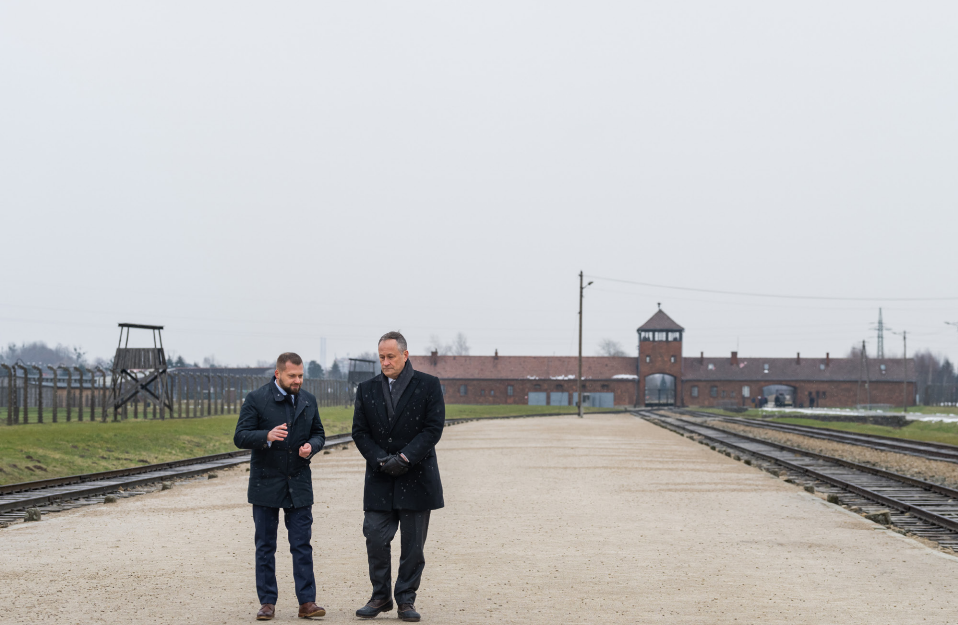
DOUG EMHOFF TOURS THE FORMER WORLD WAR II AUSCHWITZ-BIRKENAU DEATH CAMP IN OSWIECIM, POLAND. JANUARY 27, 2023.