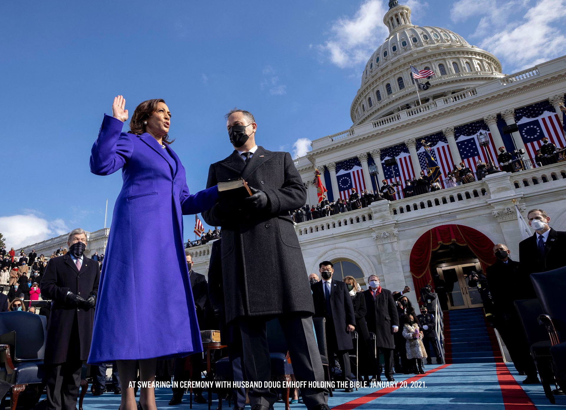
AT SWEARING-IN CEREMONY WITH HUSBAND DOUG EMHOFF HOLDING THE BIBLE. JANUARY 20, 2021.