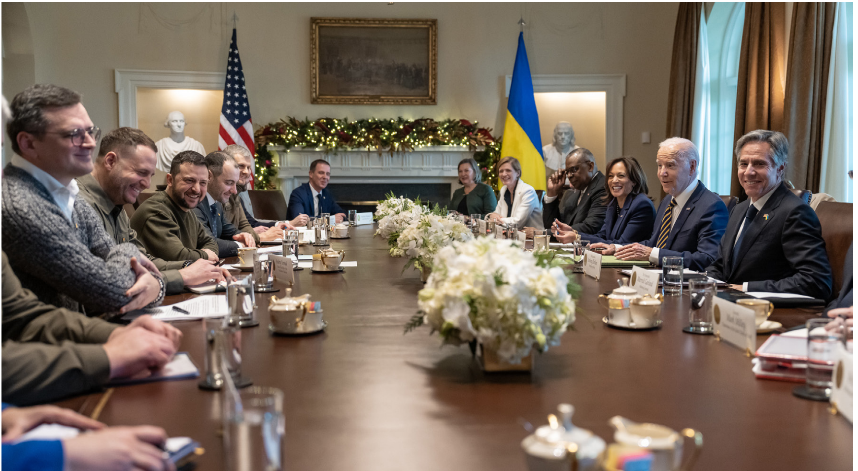
MEETING WITH UKRAINIAN PRESIDENT VOLODYMYR ZELENSKY (THIRD FROM LEFT) IN THE CABINET ROOM OF THE WHITE HOUSE. DECEMBER 21, 2022.

“President Zelensky, the stakes of your fight remain high for your country and for the entire world. And it is in the strategic interest of the United States to continue our support. International rules and norms are on the line, including the fundamental principles of sovereignty and territorial integrity. History shows us: If we allow an aggressor like Putin to take land with impunity, they keep going. The other would-be aggressors then become emboldened. President Zelensky, as President Joe Biden and I have made clear, we will be with you for as long as it takes.”