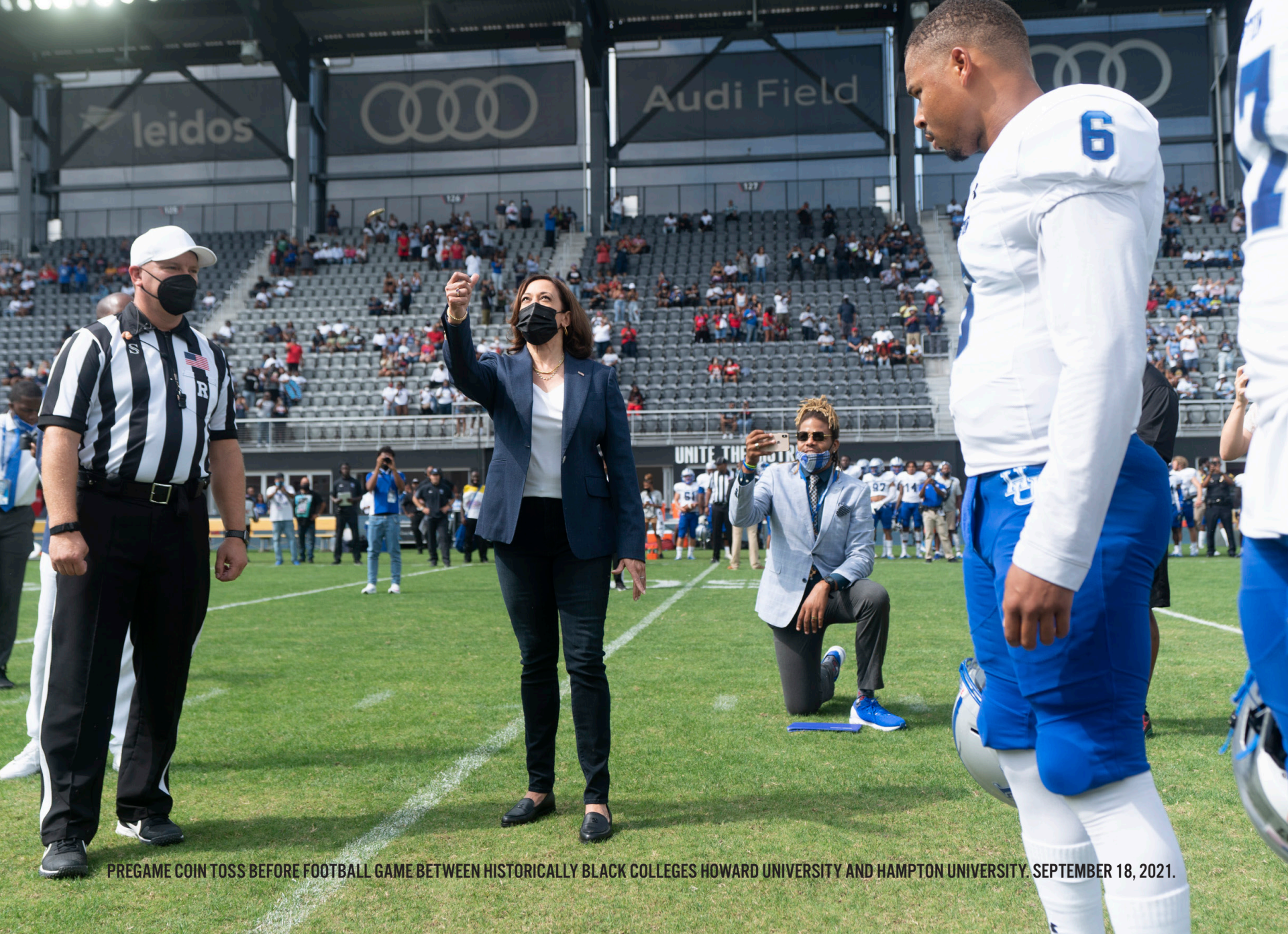
PREGAME COIN TOSS BEFORE FOOTBALL GAME BETWEEN HISTORICALLY BLACK COLLEGES HOWARD UNIVERSITY AND HAMPTON UNIVERSITY. SEPTEMBER 18, 2021.