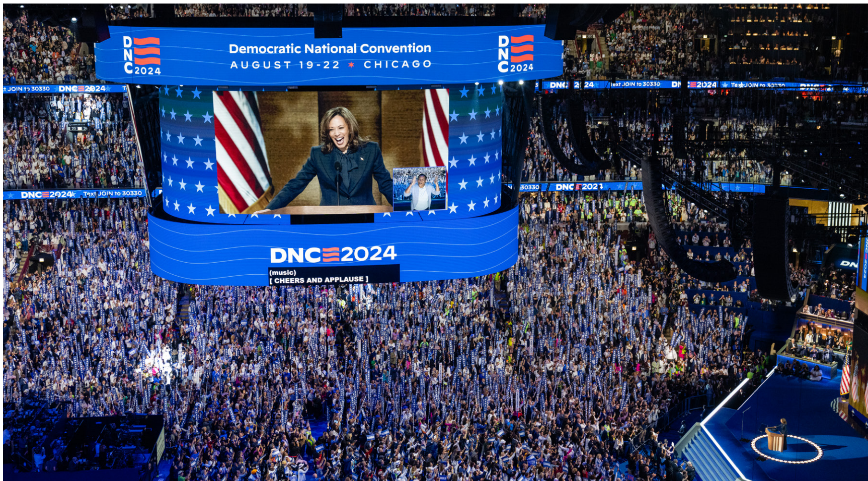
ON THE LAST NIGHT OF THE DEMOCRATIC NATIONAL CONVENTION IN CHICAGO. AUGUST 22, 2024.

“On behalf of every American, regardless of party, race, gender or the language your grandmother speaks. On behalf of my mother and everyone who has ever set out on their own unlikely journey. On behalf of Americans like the people I grew up with—people who work hard, chase their dreams and look out for one another. On behalf of everyone whose story could only be written in the greatest nation on Earth, I accept your nomination to be president of the United States of America.”