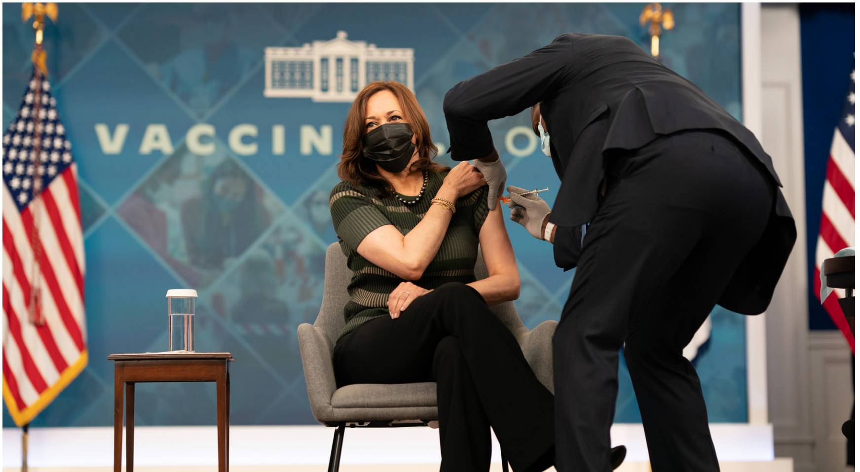
RECEIVING HER COVID-19 VACCINE BOOSTER SHOT AT THE WHITE HOUSE. OCTOBER 30, 2021.

“My mother was in the biochemical endocrinology study section. She was a peer-reviewer. And my mother had two goals in her life: to raise her two daughters and end breast cancer. In fact, a little-known fact: My first job was cleaning pipettes in my mother’s lap. She would take us with her after school and on weekends. And I grew up then around science in a way that was taught to me by someone who was so profoundly passionate about the gift that scientists give to us. Their whole reason for being is to pursue what is possible for the sake of improving human life and condition. It is such a noble pursuit.”