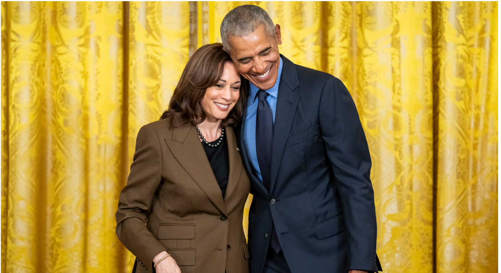
WITH FORMER PRESIDENT BARACK OBAMA AT AN AFFORDABLE CARE ACT EVENT IN THE WHITE HOUSE. APRIL 5, 2022.

“The Affordable Care Act is the most consequential healthcare legislation passed in generations in our country. And it is something more. The ACA is a statement of purpose, a statement about the nation we must be, where all people – no matter who they are, where they live or how much they earn – can access the healthcare they need no matter the cost. Protecting the health and wellbeing of the people of our nation should not be a partisan issue. Every person in our nation should be able to access and afford the healthcare they need to thrive. Not as a privilege, but as a right.”