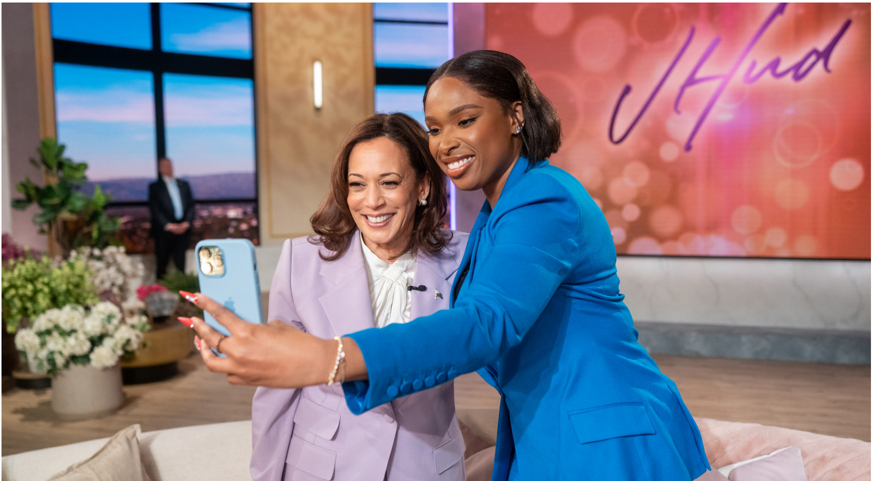
TAPING THE JENNIFER HUDSON SHOW AT WARNER BROTHERS STUDIOS IN BURBANK, CALIFORNIA. APRIL 17, 2023.

“Your voice is so important through the tragedy that you experienced. [Three members of Jennifer Hudson’s family were shot and killed in 2008.] First of all, we shouldn’t have to be presented with this false choice which suggests you’re either in favor of the Second Amendment or you want reasonable gun safety laws. I just think it is pitiful that the people in the United States Congress do not have the courage to stand up to the gun lobby, stand up to the NRA [National Rifle Association] and say, ‘Look I support the Second Amendment, but we need reasonable gun safety laws.’”