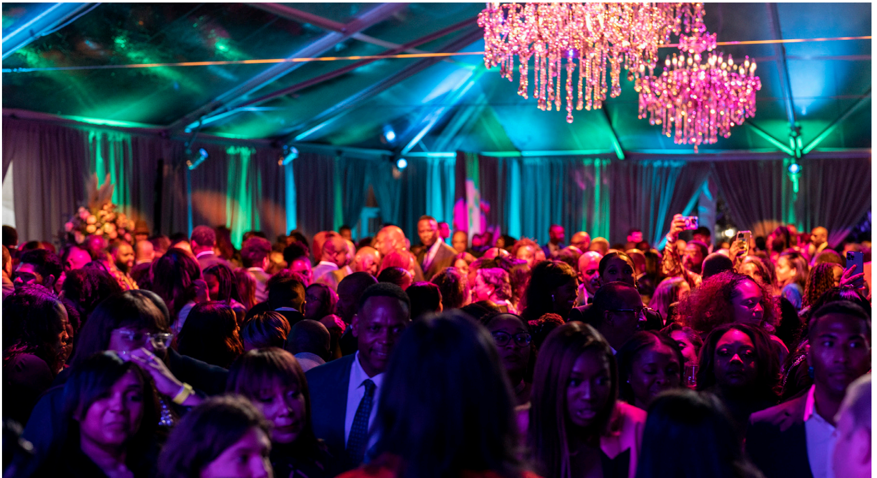
ON THE LAST NIGHT OF BLACK HISTORY MONTH, KAMALA HARRIS INVITES “BLACK TRAILBLAZERS” TO A PARTY AT THE RESIDENCE. FEBRUARY 28, 2023.

“My early memories of our parents together are very joyful ones: a home filled with laughter and music — Aretha, Coltrane and Miles. I grew up immersed in the ideals of the Civil Rights Movement. My parents had met at a civil rights gathering. And they made sure that we learned about civil rights leaders, including the lawyers like Thurgood Marshall and Constance Baker Motley — those who battled in the courtroom to make real the promise of America. As a prosecutor, when I had a case, I charged it not in the name of the victim but in the name of the people. And every day in the courtroom, I stood proudly before a judge and I said five words: ‘Kamala Harris, for the people.’”