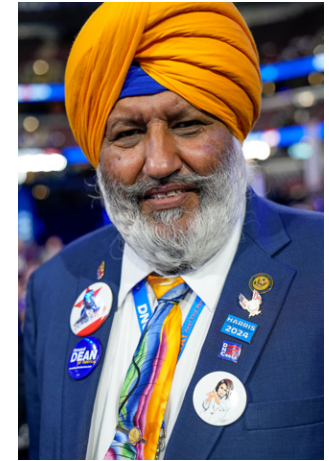
CONVENTION DELEGATES IN CHICAGO. AUGUST 2024.

“With this election, our nation has a precious, fleeting opportunity to move past the bitterness, cynicism and divisive battles of the past. A chance to chart a new way forward.”