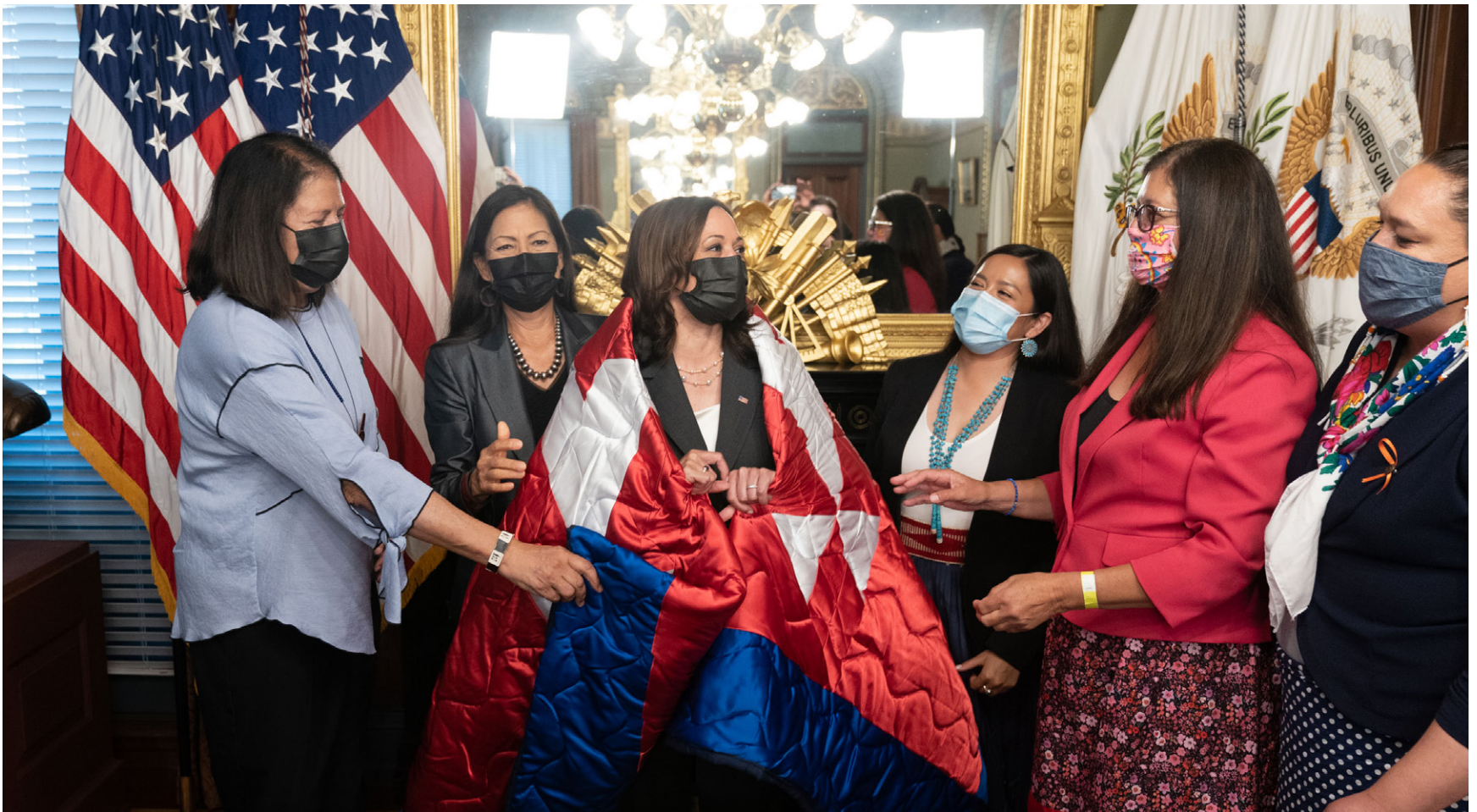
DRAPED IN A TRIBAL QUILT AT A MEETING ON NATIVE AMERICAN VOTING RIGHTS IN THE VICE PRESIDENT'S CEREMONIAL OFFICE. JULY 27, 2021.

“The bonds between our nations are sacred. And we believe we have a duty to safeguard and strengthen those bonds, a duty to honor tribal sovereignty, to ensure tribal self-determination, to uphold our trust and treaty obligations, and to fight to make sure all Native communities have the support and the resources they need to succeed and to thrive. And to do so, we must always speak truth – no matter how difficult it is for some to hear– about our history.”