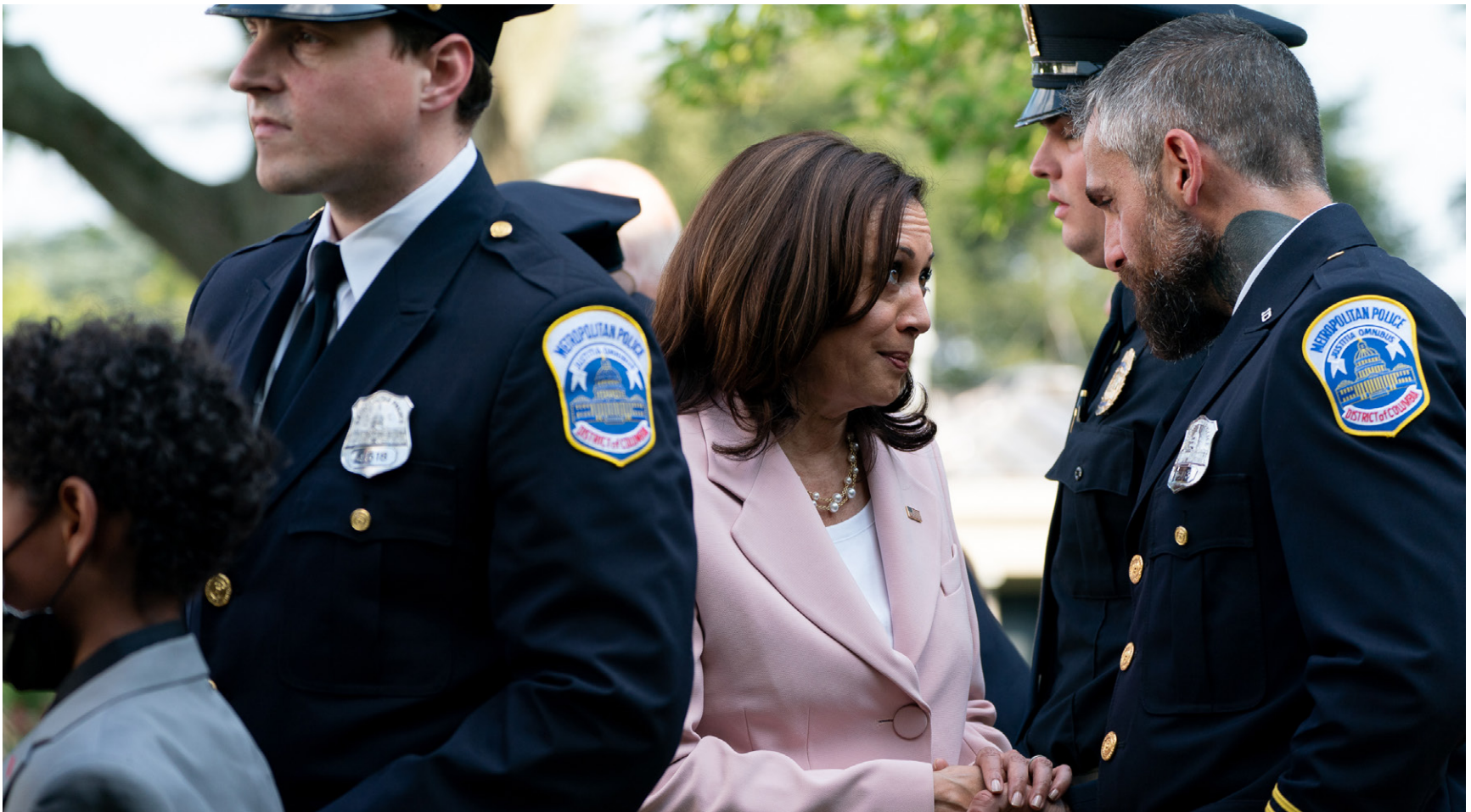
GREETING U.S. CAPITOL AND METROPOLITAN POLICE OFFICERS AND FAMILIES AT AWARDING OF CONGRESSIONAL GOLD MEDALS. AUGUST 5, 2022