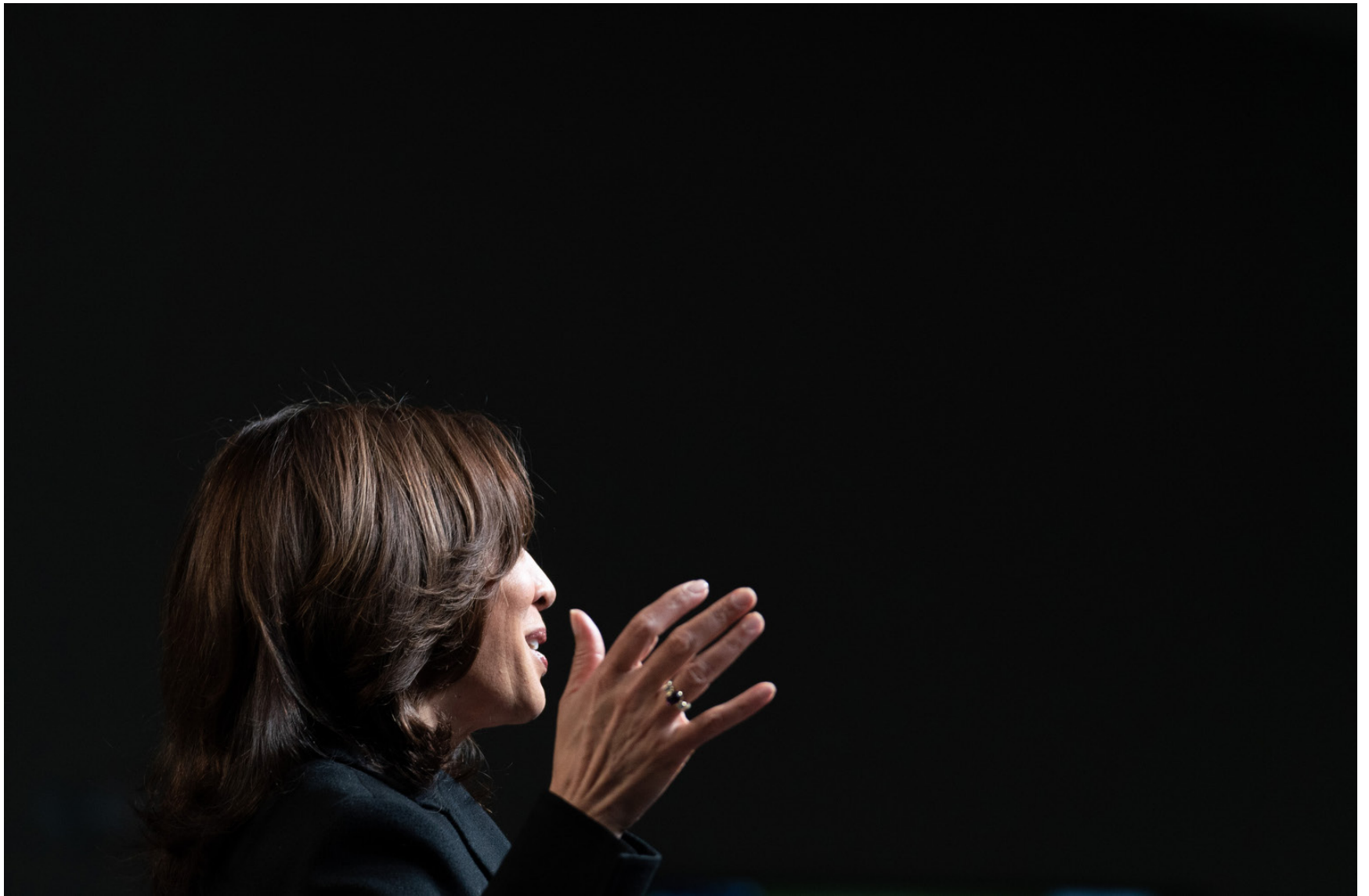
Vice-presidential photographer Lawrence Jackson took this photo of Kamala Harris at a Black History Month celebration. February 27, 2021.