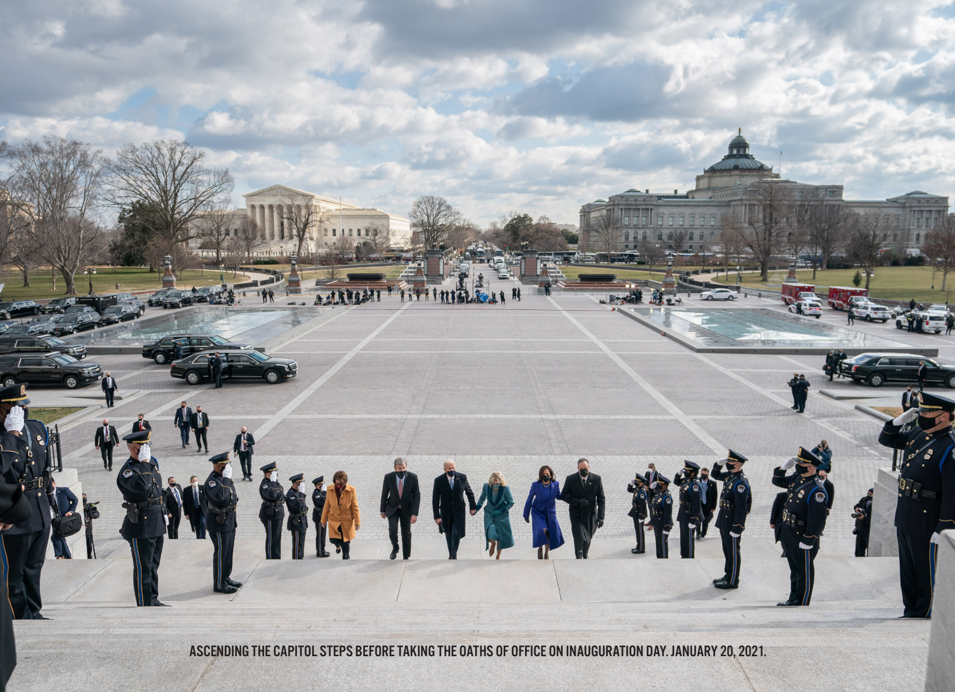
ASCENDING THE CAPITOL STEPS BEFORE TAKING THE OATHS OF OFFICE ON INAUGURATION DAY. JANUARY 20, 2021.