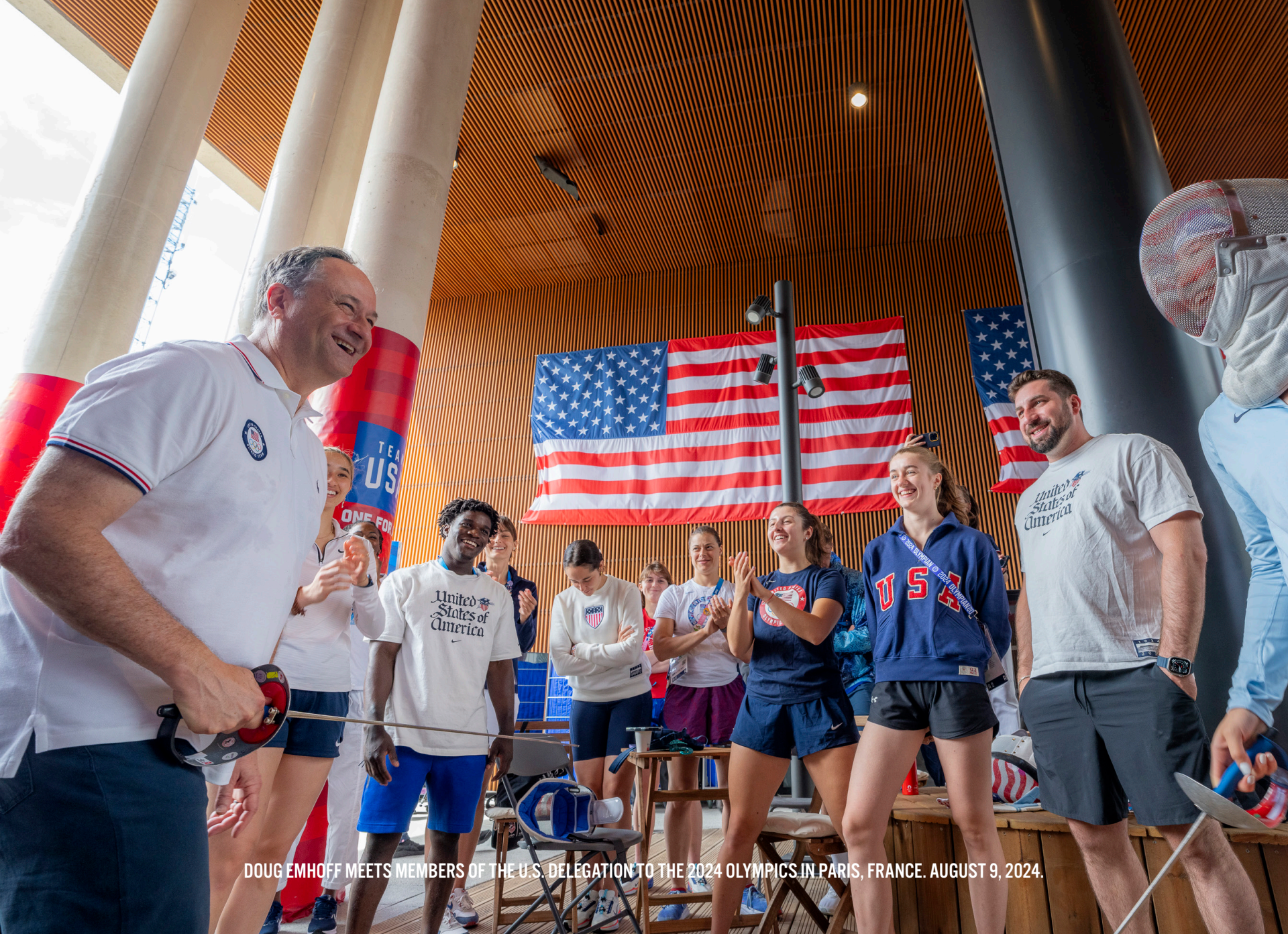
DOUG EMHOFF MEETS MEMBERS OF THE U.S. DELEGATION TO THE 2024 OLYMPICS IN PARIS, FRANCE. AUGUST 9, 2024.