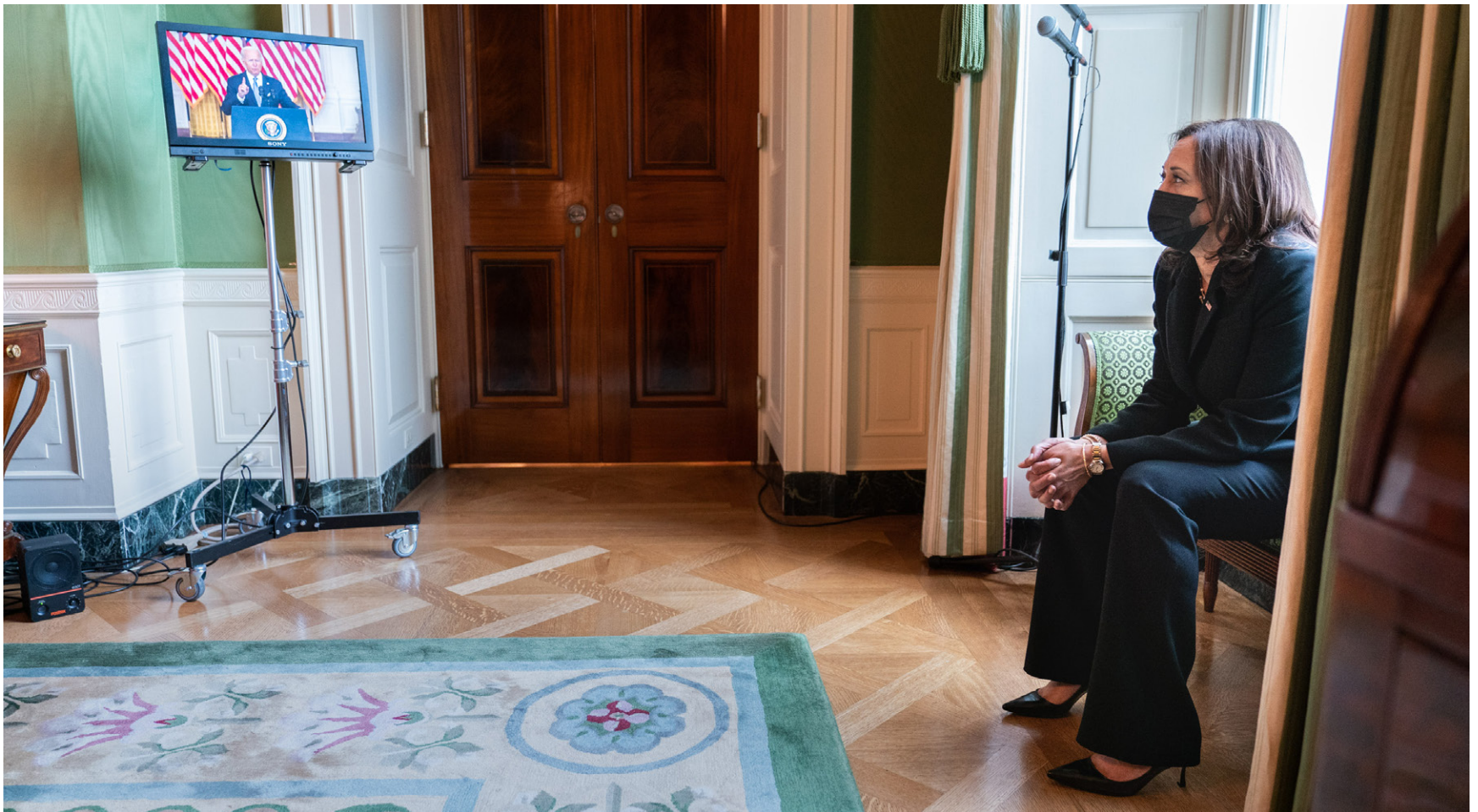
WATCHING PRESIDENT BIDEN TALK ABOUT THE COLLAPSE OF THE AFGHAN GOVERNMENT TO THE TALIBAN. AUGUST 16, 2021.

“I agreed with President Biden’s decision to pull out of Afghanistan. Four presidents said they would, and Joe Biden did. And as a result, America’s taxpayers are not paying the $300 million a day we were paying for that endless war.”