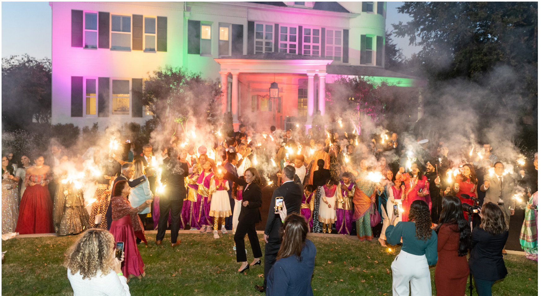
CANDLES AND SPARKLERS MARK DIWALI, THE FESTIVAL OF LIGHTS, AT THE VICE PRESIDENT'S RESIDENCE. OCTOBER 21, 2022.

“I have such fond memories of celebrating Diwali as a child. Like many of you, we would go to India about every other year, avoiding monsoon season and we would go for Diwali. Diwali is a holiday of hope. As with so many cultures, Diwali reminds us to see the light in our world, in each other and in ourselves. We also are reminded to shine our light in the darkness, to fight for peace, for justice, for understanding, even as powerful forces work to sow hate and division. We remember that in these moments where we see darkness, our light shines the brightest.”