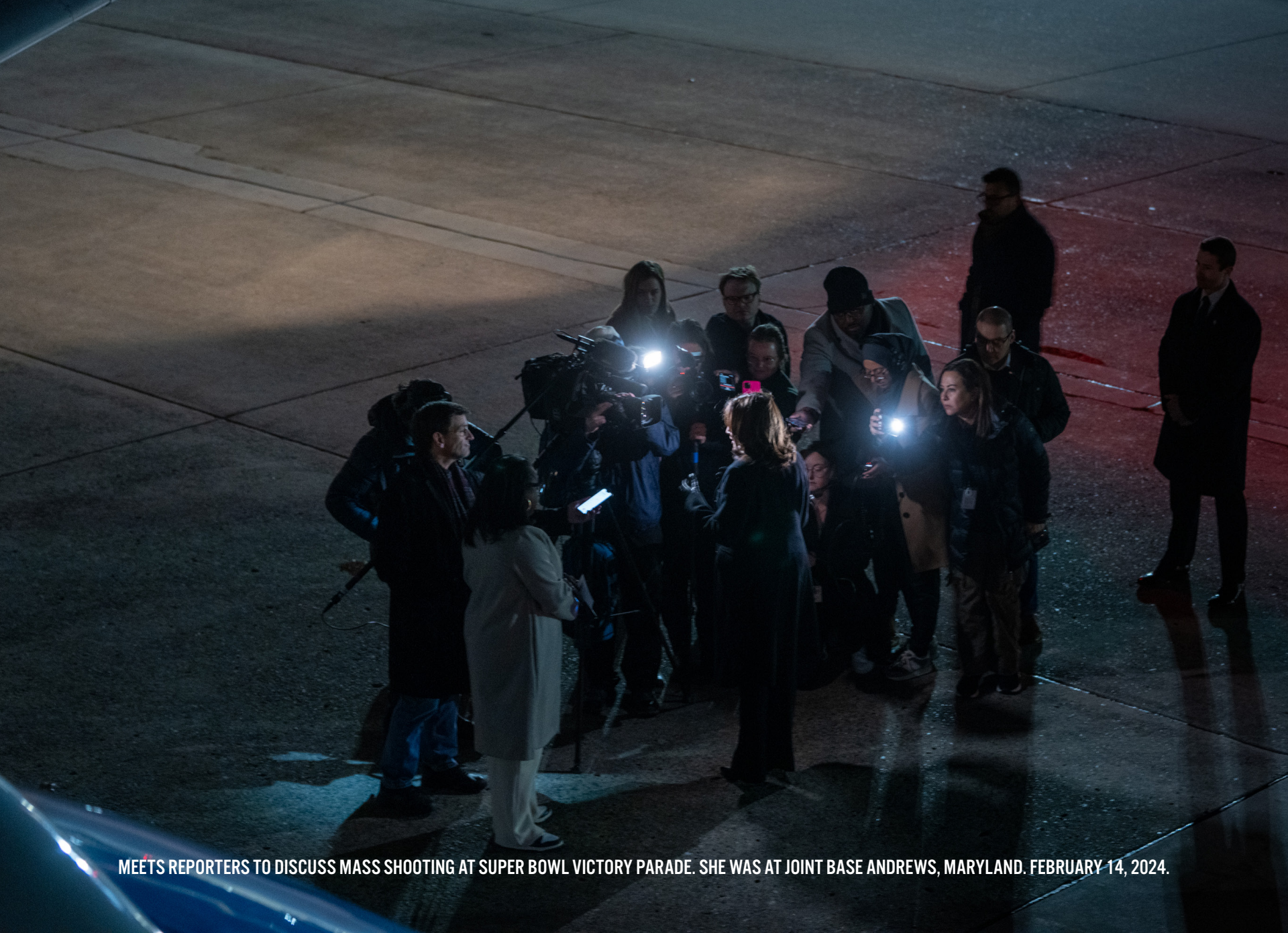
MEETS REPORTERS TO DISCUSS MASS SHOOTING AT SUPER BOWL VICTORY PARADE. SHE WAS AT JOINT BASE ANDREWS, MARYLAND. FEBRUARY 14, 2024.