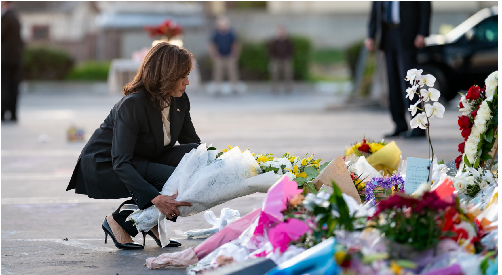
PLACING MEMORIAL FLOWERS OUTSIDE A MONTEREY PARK, CALIFORNIA, DANCE STUDIO THAT WAS THE SITE OF A MASS SHOOTING. JANUARY 25, 2023.

“I would often explain this to console survivors of crime. To remind them: No one should be made to fight alone.”