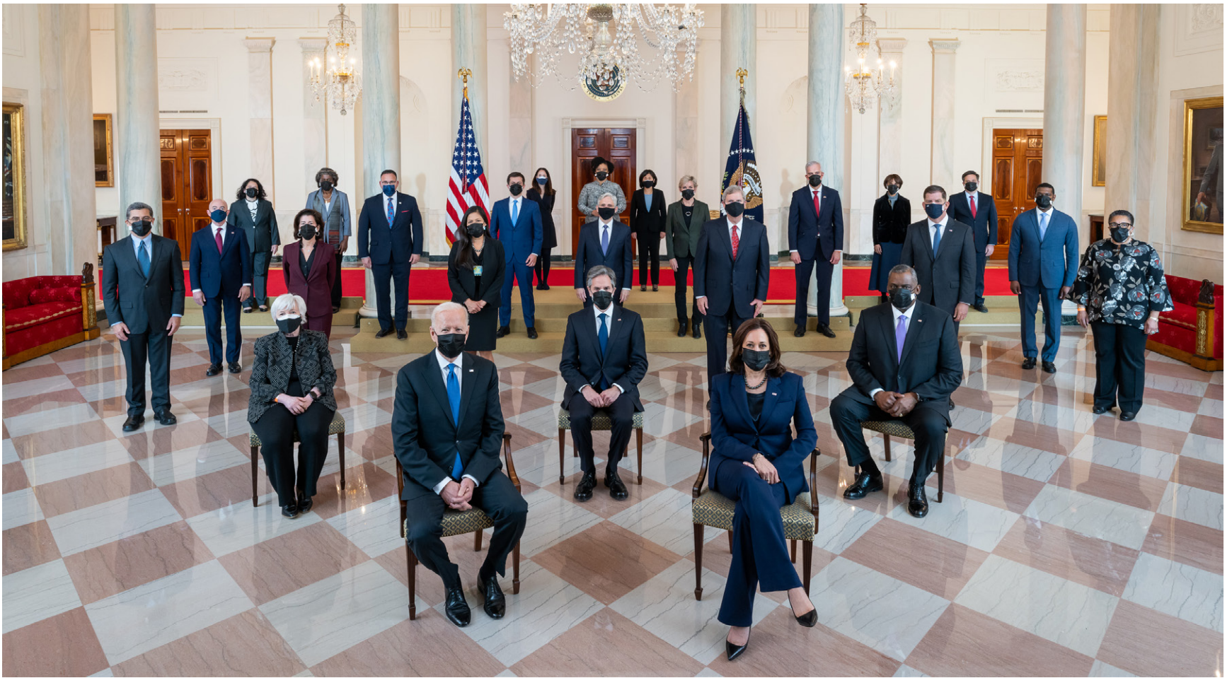
WITH CABINET MEMBERS IN THE GRAND FOYER OF THE WHITE HOUSE. APRIL 1, 2021.

“When President Biden and I were getting ready to take office, we knew what the country was up against. We knew we needed to be ready to go on day one. We started to plan not with abstract problems in mind but with real people in mind. The frontline workers who hold their breath from the time they get home to the time they leave work, praying that their family stays healthy. The small-business owners who keep changing their business model again and again. The women who are juggling so many responsibilities, at work and at home, and women who wish they just had a job at all. These days have been long for the American people.”