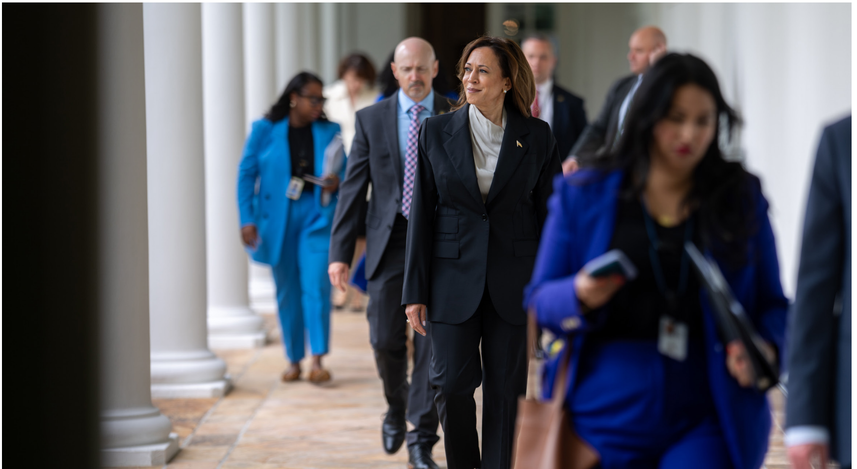
THE DAY AFTER ANNOUNCING HER CAMPAIGN FOR PRESIDENT, HARRIS WALKS ON THE WEST COLONNADE OF THE WHITE HOUSE. JULY 22, 2024.

“In this election, we each face a question: what kind of country do we want to live in. There are some people who think we should be a country of chaos, of fear, of hate, but we choose something different. We choose freedom.”