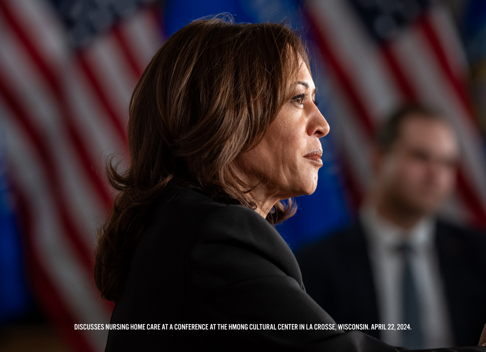
DISCUSSES NURSING HOME CARE AT A CONFERENCE AT THE HMONG CULTURAL CENTER IN LA CROSSE, WISCONSIN. APRIL 22, 2024.