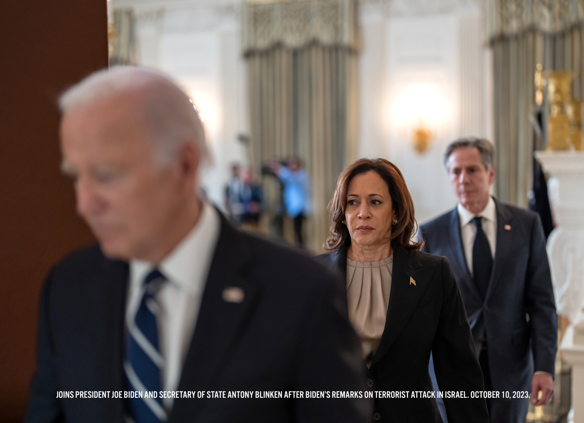
JOINS PRESIDENT JOE BIDEN AND SECRETARY OF STATE ANTHONY BLINKEN AFTER BIDEN'S REMARKS ON TERRORIST ATTACK IN ISRAEL. OCTOBER 10, 2023.