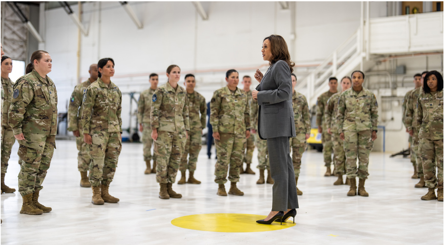
U.S. SPACE FORCE GUARDIANS AT THE PETERSON SPACE FORCE BASE IN COLORADO SPRINGS, COLORADO. MAY 30, 2024.

“I think everyone recognizes how extraordinary space is. Whether it is satellites that orbit the Earth, humans that land on the Moon or telescopes that peer into the furthest reaches of the universe. Space is exciting. It spurs our imaginations, and it forces us to ask big questions. There are so many opportunities in space for our country and for all of humanity. From science, to commerce, to national security. Our space capabilities provide for global awareness, global connectivity, and global navigation. And, of course, we also know the threats we face in space.”