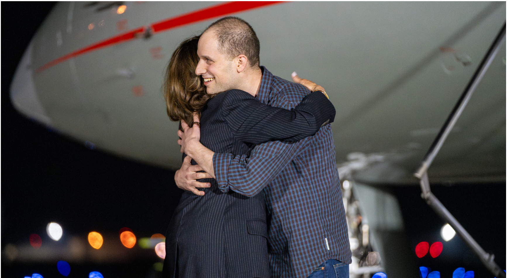
GREETING JOURNALIST EVAN GERSHKOVICH AND OTHERS AT JOINT BASE ANDREWS AFTER HIS SIXTEEN MONTHS OF DETENTION IN RUSSIA. AUGUST 1, 2024.

“Over many years, President Biden and I and our team have engaged in complex diplomatic negotiations to bring these wrongfully detained Americans home. We never stopped fighting for their release. And today, in spite of all of their suffering, it gives me great comfort to know that their horrible ordeal is finally over. As we celebrate today’s news, we must also keep front of mind that there are other Americans that are unjustly being held in places around the world. We will never stop fighting for their release. We will never waver in our commitment to bring home every American who has been wrongfully detained or held hostage. That is my solemn commitment to my fellow Americans, which I will always honor.”