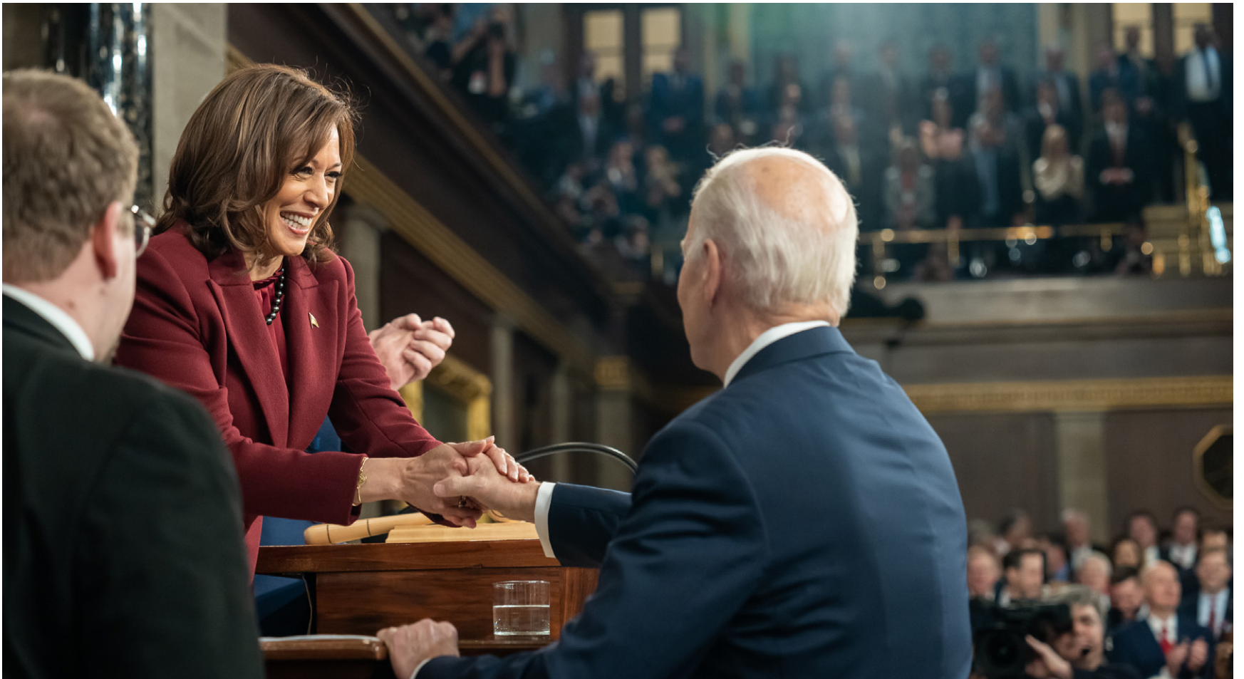
GREETING PRESIDENT JOE BIDEN AS HE ARRIVES TO DELIVER THE STATE OF THE UNION ADDRESS. FEBRUARY 7, 2023.

“We’re all born leaders, and it’s just a matter of when people decide to turn that on.”