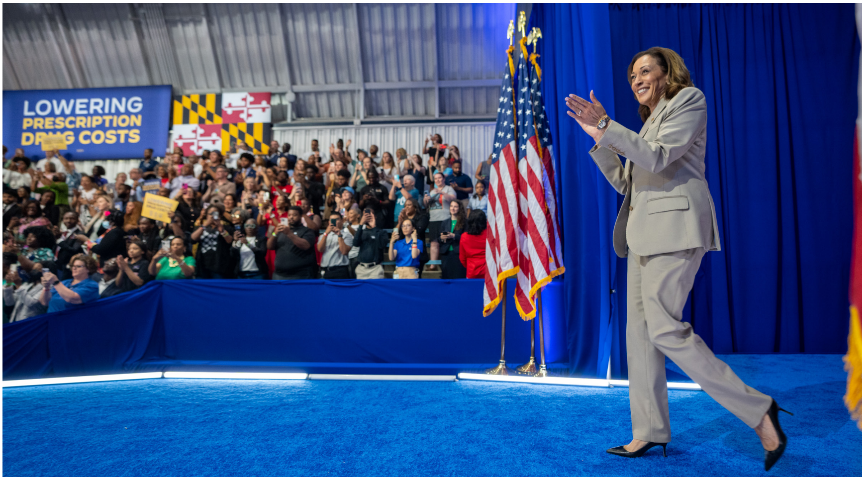
ON STAGE IN LARGO, MARYLAND, TO TALK ABOUT LOWERING THE COSTS OF MEDICARE PRESCRIPTION DRUGS. AUGUST 15, 2024.

“We believe deeply every senior in our nation should be able to live with security, stability and dignity. Two years ago, we gave Medicare the power to negotiate lower prescription drug prices for the first time in history. It is nearly impossible for a patient to negotiate lower prices by themselves. It’s one person against a huge corporation. But Medicare represents more than 65 million people. And so Medicare has collective bargaining power. And now Medicare can use that power to go toe-to-toe with Big Pharma and negotiate lower drug prices.”